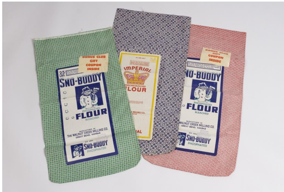
Figure 3. 25 pound flour sacks with pasted paper labels. ( back to top )