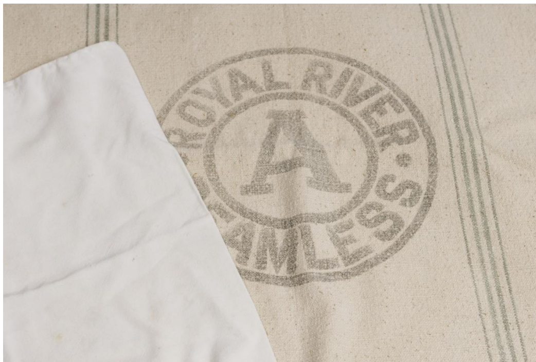
Figure 2. Solid white percale feed sack over a branded feed sack of osnaberg. (back to top)