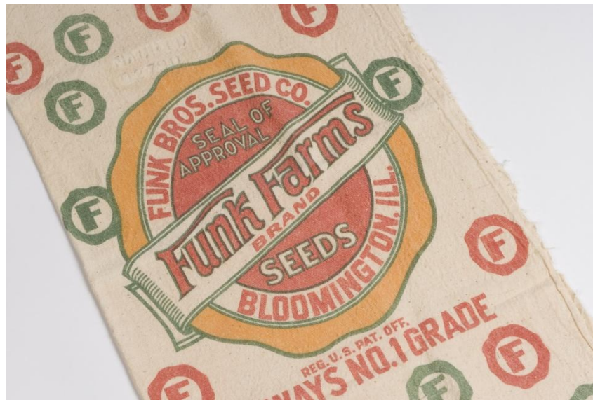
Figure 1. Branded feed sack made of osnaberg. Used for towels, aprons, and undergarments. (back to top)