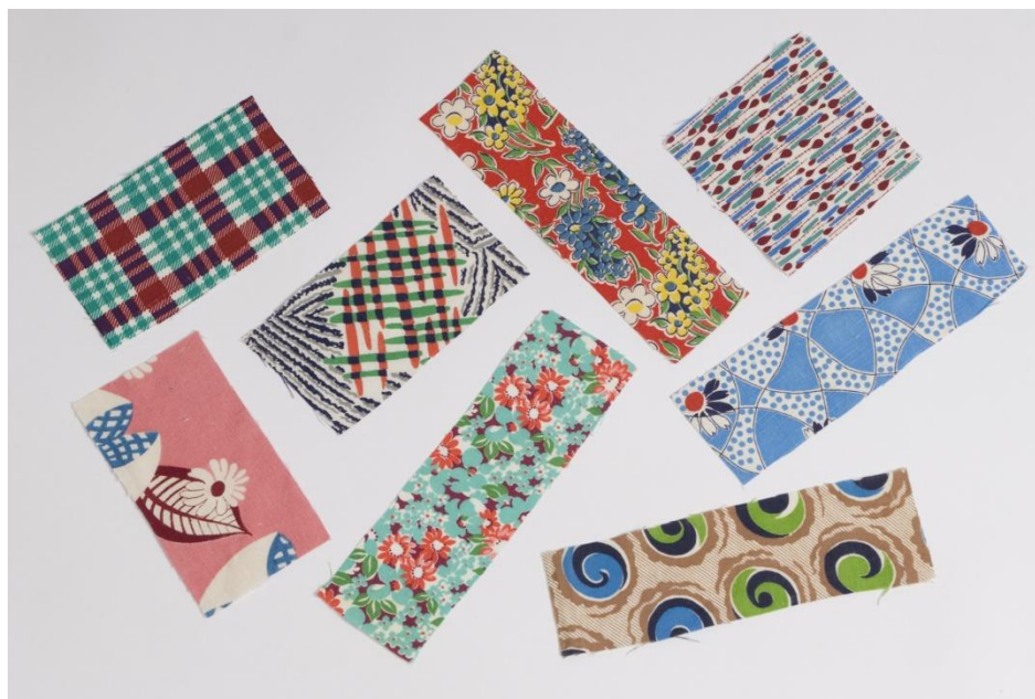
Figure 4. Swatches of printed feed sacks. The fabrics pictured were used for boy's shirts, men's boxers, children's pajamas, mattress covers, and aprons. ( back to top )