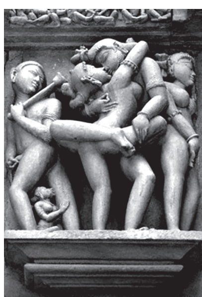
An erotic sculpture at the Hindu Temple, Kajuraho, India.

These preliminary observations guide us to investigate the relationship of architectural space and erotic air on a more philosophical level.