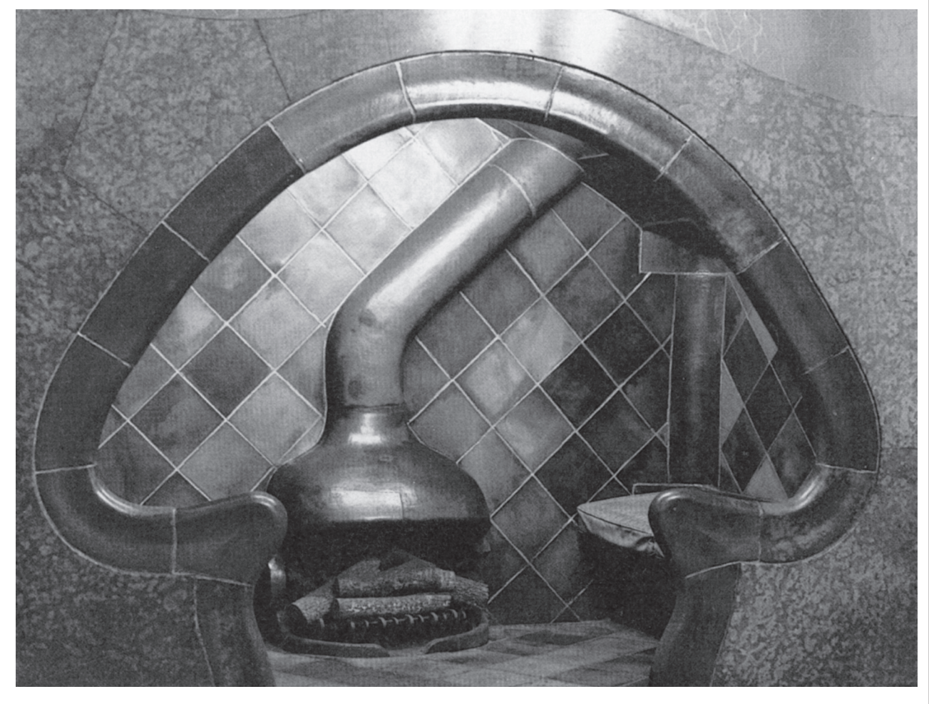
Antoni\ Gaudi,\ Casa\ Batllo,\ Interior\ view\ of\ fireplace,\ Barcelona,\ 1905-07.

Positive and invigorating spaces stimulate our muscular and tactile senses. Whereas retinal images promote distance and detachment, these haptic experiences give rise to the sense of nearness, intimacy and acceptance. Light caressing a surface and revealing its shape and texture, as well as the hapticity of matter and details, crafted to address the body and the hand, evoke an eroticized and welcoming air. The space of the home is ultimately an extension of its inhabitant's skin, and the deepest experiences of homecoming are experiences of intimate warmth and naked skin. The union of the dweller and the house is a kind of a marriage, a relationship in which the house caresses the inhabitant and the inhabitant finds ultimate pleasure in his or her dwelling.