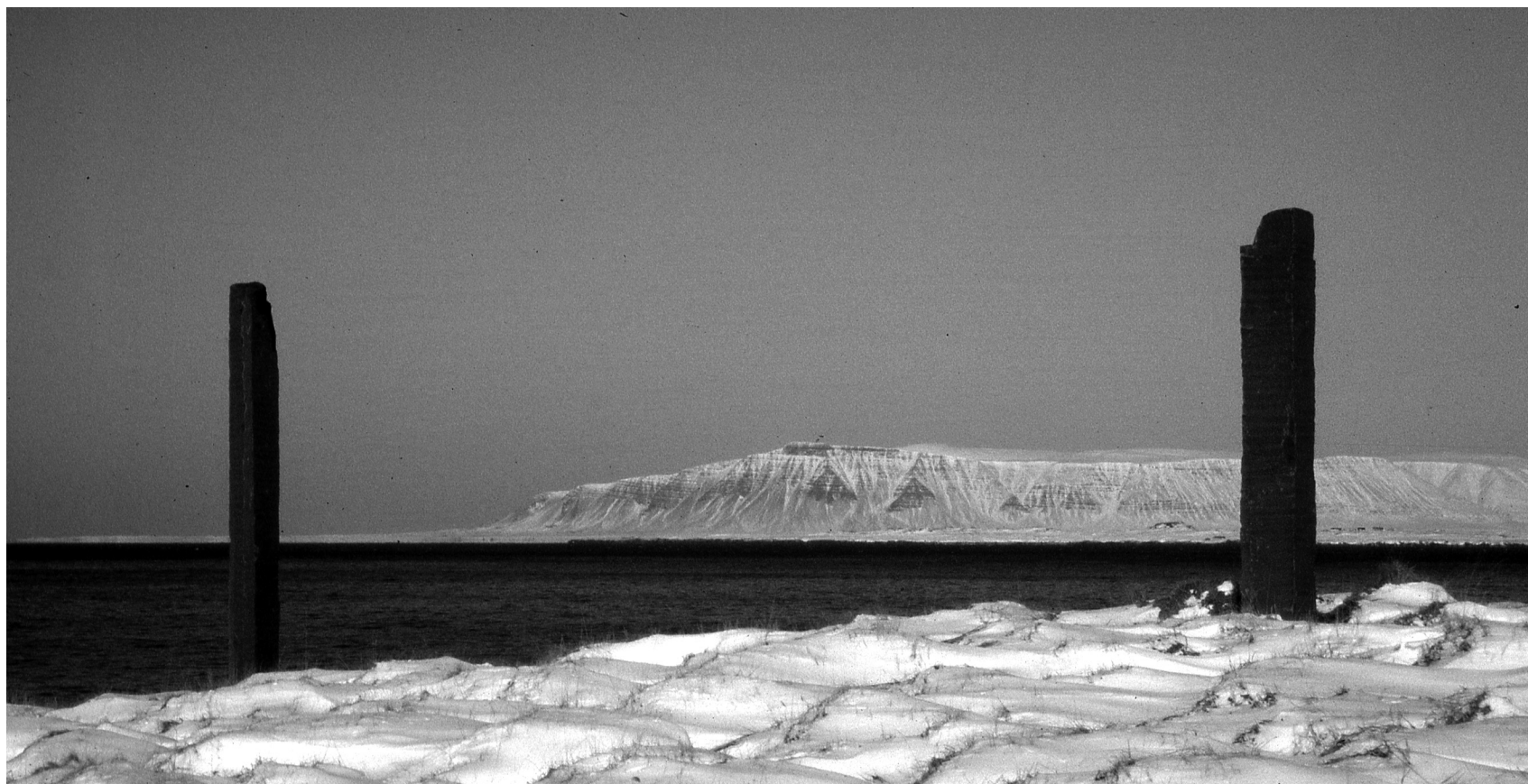
Afangar by Richard Serra