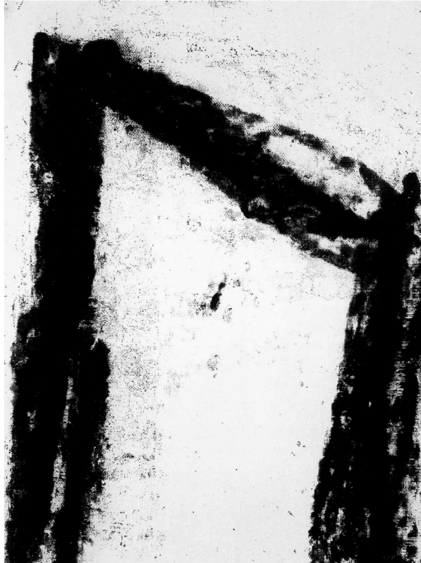
Videy Drawing II by Richard Serra