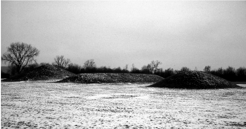
Mound City, Chillicothe, Ohio

A film should have a beginning, a middle and an end, but not necessarily in that order.