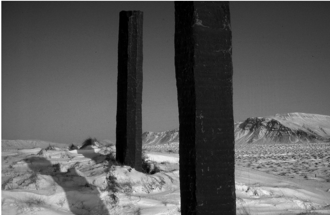
Afangar by Richard Serra

Esja Mountains, and somewhere in the distance are Sneffel and Scartaris, along the crater of which the expedition sent by Jules Verne descended to the center of the Earth. We are at the cape at Vesturey, which, over a narrow isthmus joins the Videy Island, where