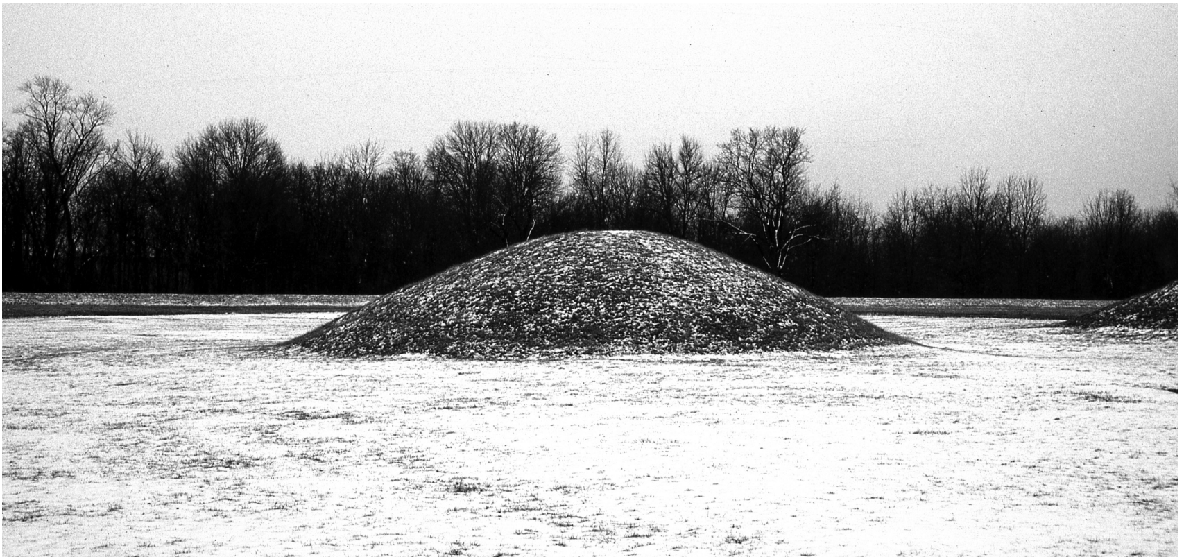
The bodies were burned on a clay plinth in a crematorium built from logs. After ten to thirteen burials the building was dismantled and moved to a new location. The artifacts of the deceased were covered with earth, and the mound was then covered with gravel and round stones

oval base, somewhat like a ridge. The mounds seem to have no discernible order, symmetry, or astronomical code. Because the ground still a moment ago was bare, the oblique snowfall quickly replaces the shadow lines; the windward side of the mounds is soon white, while the sheltered side remains green. The almost-square field is delineated by a low wall. Only a few gnarled oaks remain within the perimeter, though on the outside begins a dense forest. The murmur of the Scioto River can be heard from beyond the trees.