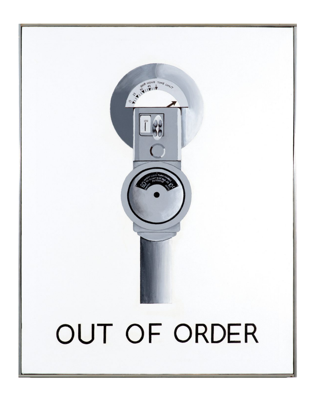
Vern Blosum, Out of Order , 1962. Oil on canvas, 36.25 \times 28.60 inches.

Blosum's paintings were made to demonstrate the insipid lack of value, skill, and seriousness of an emerging movement the artist wished to derail. As Blosum recently explained: "My reaction to Pop Art was quite intense and quite aggravated.... [T]his form of