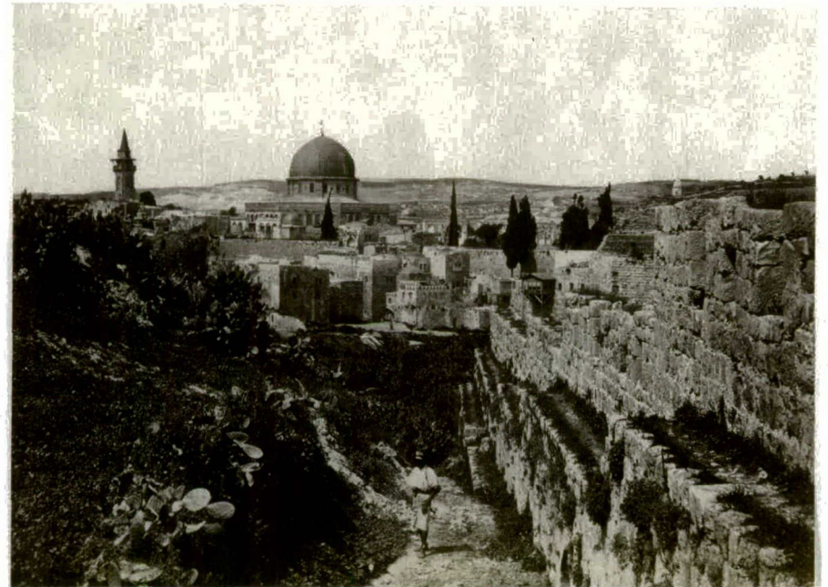
The Site of the Holy Temple, Jerusalem, 1860. Francis Frith. The J. Paul Getty Museum, Los Angeles.

Protestant visitors were not too interested in the traditional holy places. That's because they thought many had been ruined by an overlay of postbiblical shrines and monasteries. Instead, travel guides led