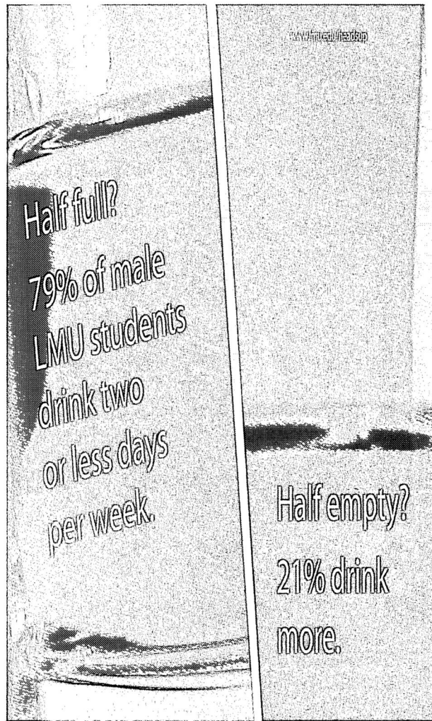
Figure 1. Posters Used in Social Norms Poster Campaign