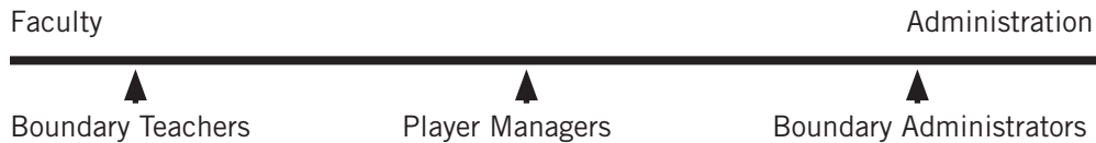
Figure 2. Continuum of teacher-AP experiences.