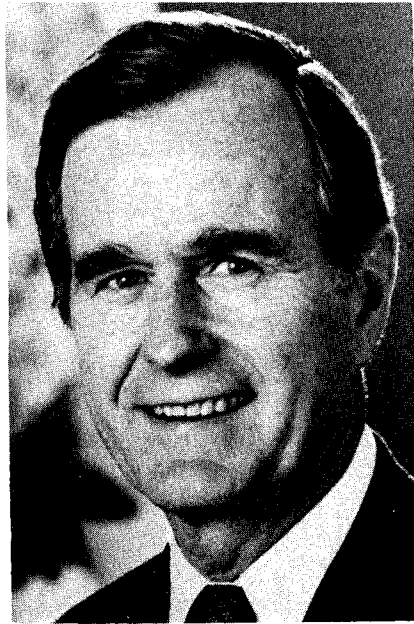
Vice President George Bush