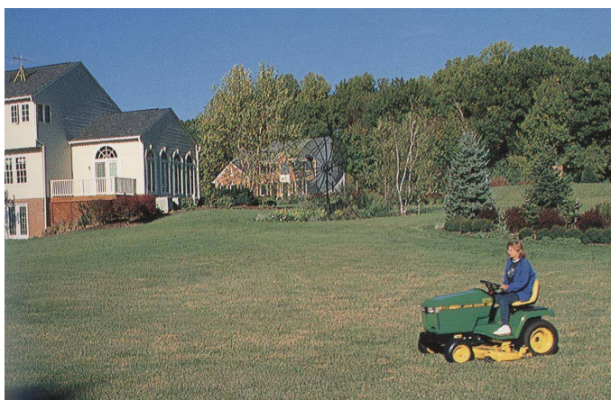
Figure 1. The idealized American urban landscape consists of lawns and garden patches around a single-family household. Maintaining this “dreamscape” requires many human management inputs including lawn mowing.

In the United States, over 80% of the total population—more than 250 million people—live in the urban, suburban and exurban landscapes that cover over 25% of the country's terrestrial surface; these numbers will likely increase well into the future (Brown et al. 2005; UN 2007). In urbanized landscapes, 79% of American households help manage over 128,000 km 2 of lawns and gardens—more area than covered by any single food crop—and thus contribute to a $147.8 billion landscaping industry (NGA 2004; Milesi et al. 2005; Hall et al. 2006). The magnitude of the urban landscaping endeavor and its associated green spaces have emerged from our collective pursuit of the American dream in which homeowners maintain idealized lawns and gardens around their homes to symbolize, in part, successful realization of this iconic vision (Figure 1; Jenkins 1994). Arguably then, the majority of Americans interact more today with lawns and gardens (conceptually, physically, and emotionally) than any other outdoor environments.