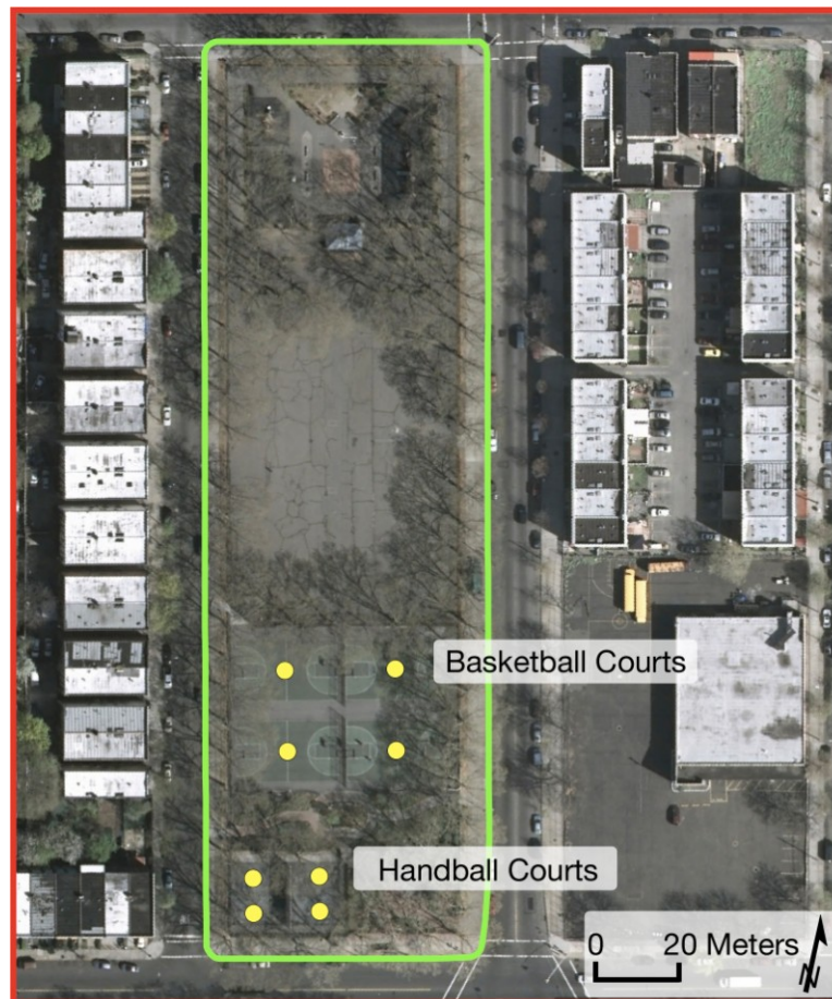
Figure 3. Example of the geocoded park activity sites and access points at Watson Gleason Park in the Bronx (Maroko et al. 2009).

The park features data (elements within the parks) were created as a collaboration between the New York City Department of Parks and Recreation and Lehman College of the City University of New York. Researchers traveled to all of the New York City parks carrying portable GPS units and recorded the locations of many of the parks' features, including park entrances, sports facilities, ball fields, and other recreational areas (Figure 3). Researchers used aerial photos and other remote sensing GISc technologies to rectify the GPS park features data and further supplement the dataset in locations where features such as park entrances were not recorded. For parks without specific points of entry (e.g., open spaces without fences) and parks not included in the GPS survey, the researchers coded entrance points at roughly 30m intervals around the accessible parts of the parks' perimeters.