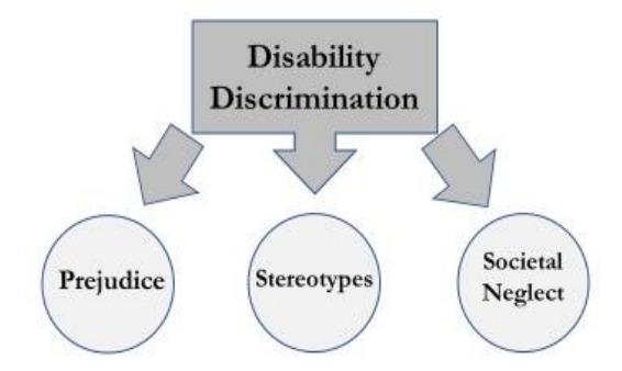
The ADA's text and legislative history confirm this protection from prejudice, stereotypes, and neglect, as do Supreme Court decisions interpreting the ADA and Section 504.<sup>9</sup>