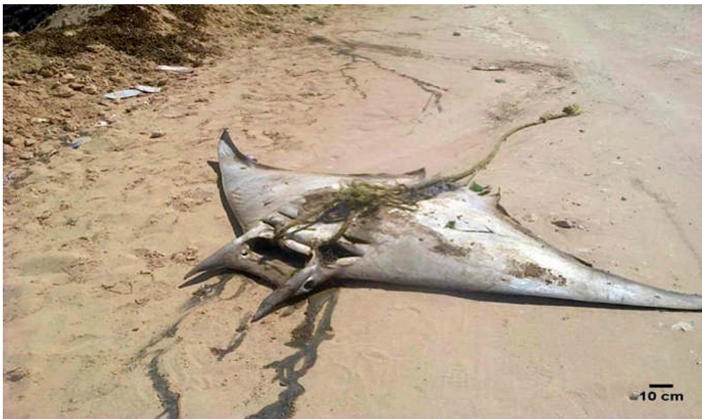
Figure 2. The specimen Mobula mobular stranded at "la Madrague" Beach (05/09/2017).

Measurements were made on biometric characteristics of M. mobular stranded on "la Madrague beach", and description are resumed in table 1. It appears that measurements reported as percentage of total length (TL) were as follows: Disc Length (82.56%), Disc width (171.27%), Tail spine length (136.42%), Eye diameter (4.73%), Mouth width