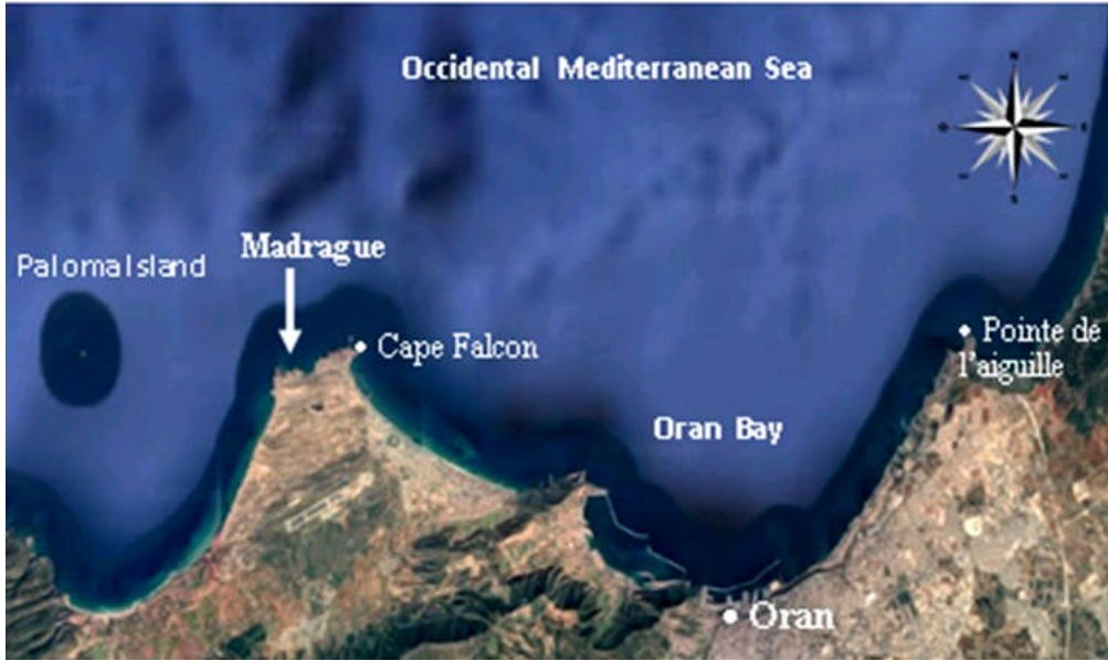
Figure 1. Stranding zone of Mobula mobular ("La Madrague" Beach).