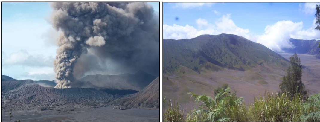
Figure 3. Crater (left) and savanna land (right) of Bromo mount

Historically, the mount of Bromo and other mountains around the Tengger Caldera are formed from the eruption of Mount Tengger. Mount Tengger is estimated to have a height of about 4000 meters above sea level and is considered the largest and highest mountain in its time. As it erupts, the eruption of tengger mountain creates a sea of sand which at that time filled with water. In subsequent developments, emerged several magma streams in the middle of the caldera and formed new mountains such as mount of Bromo, mount of Widodaren, mount of Watangan, mount of Batok (Figure 4) and mount of Kursi.