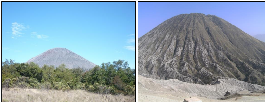
Figure 4. Mount of Semeru (left) and Batok (right)

Mount of Semeru is a mount that is considered the most sacred by the people of Tengger. Mount of Semeru is considered a manifestation of one of Tengger people's as the grandmother of Demak Diningrat. People who are on this mountain are advised to say and behave in a positive and beneficial manner. Negative things should be avoided because it can cause dangerous or bad luck to the person.