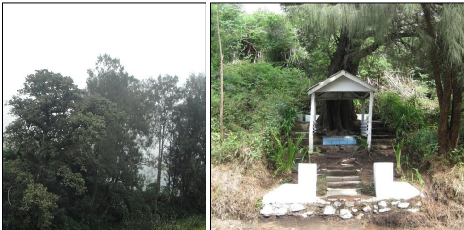
Figure 2. Pedanyangan (left) and Punden Kutungan (right) of Ngadas Village

The form of the pedanyangan usually temple or old tomb, a hidden spring, a collection of large trees such as banyan ( Ficus sp.) or areas that have a special natural landscape. In some places, the pedanyangan also called punden . In the village of Ngadas, pedanyangan has a form of a collection of large trees such as mountain pine ( Casuarina junghuhniana Miq.) and danglu or ki hujan Tree ( Engelhardia spicata Blume.), in which there is a heritage European-style building of Raden Panji Wulung, a figure of antiquity.