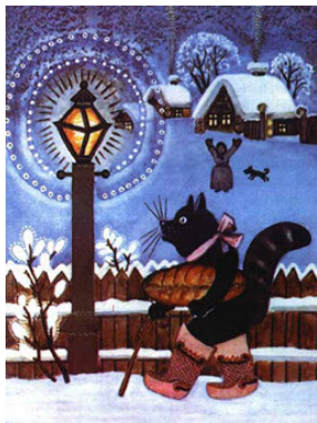
Figure 5. Koten'ka Kotok. Illustration in a children's book. Artist Y. Vasnetsov http://miryanin.narod.ru/vasnecov3.jpg

In the course of the study children with ASD and mental retardation made a lot of errors. For example, they called storks geese, which flew in jamb. They called dogs deer, who were harnessed to a team. The castle looked like Moscow (linked to the image of the Kremlin), they called a dwarf Santa Claus, and a cat – a wolf, a squirrel – a fox, a girl – a grandmother, etc.