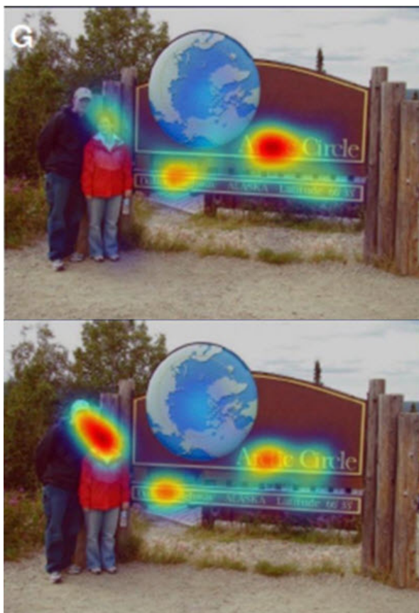
Figure 1. The trajectory of view of people with ASD in comparison to the look of “ordinary” people.

brazheniya pokazyvayut, kak autisty vidyat mir [These images show how autistics see the world]).