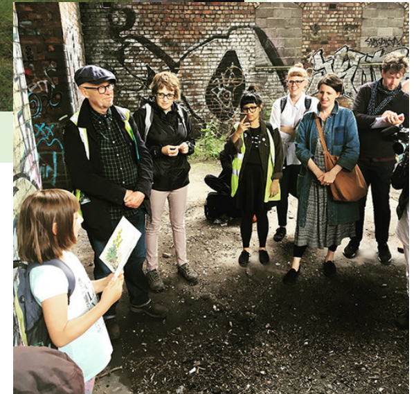
Images from ' Pomona Encounters ': A series of site-specific exhibits and performances as part of Manchester European City of Science.