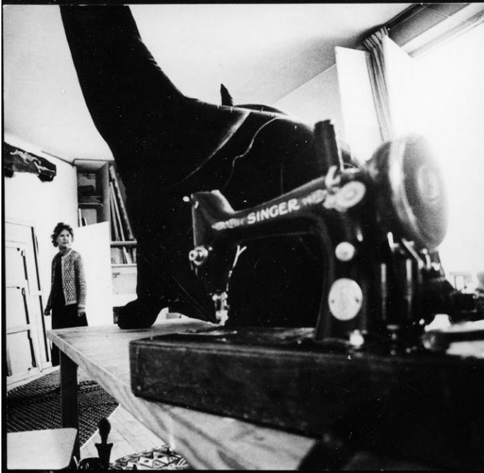
Dorothea Tanning in her studio with Pincushion to Serve as a Fetish, 1979.