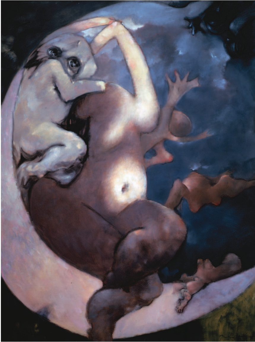
5.3 Dorothea Tanning, Murmurs , 1976. Oil on canvas 51.2 × 38.2 in. (130 × 97 cm). © The Estate of Dorothea Tanning/Artists Rights Society (ARS), New York/ADAGP, Paris, 2014.