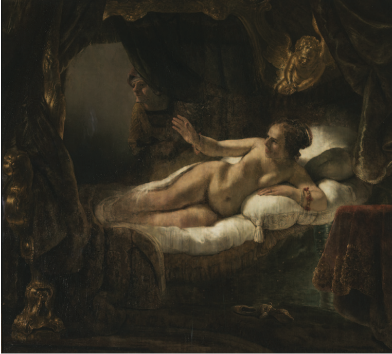
Rembrandt Harmensz. van Rijn, Danae , 1636. Oil on canvas, 72.83 × 79.72 in. (185 × 202.5 cm), Holland. Inv. no. GE-723. Collection of The State Hermitage Museum, St. Petersburg.