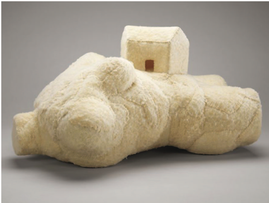
5.6 Louise Bourgeois, Femme Maison, 2001. Fabric and steel, 11 × 15 × 26 in. (27.9 × 38.1 × 66 cm).