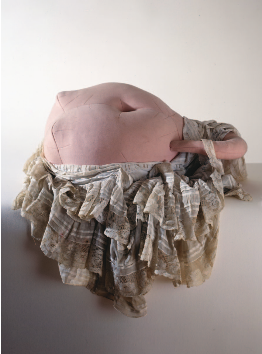
5.1 Dorothea Tanning, Emma , 1970. Fabric, wool and lace, 11.7 × 25.4 × 21.6 in. (29.7 × 64.5 × 54.8 cm); body: 11 × 22 × 12 in. (body: 27.9 × 55.9 × 30.5). The Nelson-Atkins Museum of Art, Kansas City, Missouri. © The Estate of Dorothea Tanning/Artists Rights Society (ARS), New York/ADAGP, Paris, 2014.