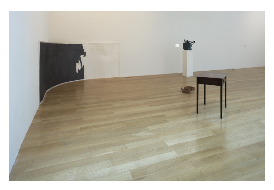
Fig. 3. Lucy Skaer installation view at The Fruitmarket Gallery, 2008. Mixed media.