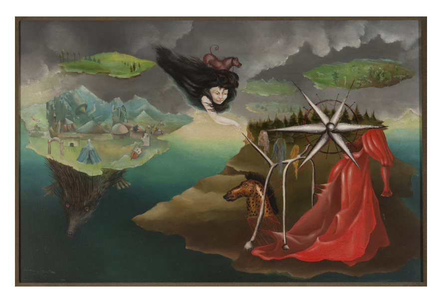
Fig. 5. Leonora Carrington, Artes 110, 1942. © Estate of Leonora Carrington / ARS, NY and DACS, London 2018.

Again Carrington extends her own imagery in a painting known as Artes 110 (1942), where the landscape has ruptured into an airborne archipelago. The broken palace turrets on the floating island towards the left of the painting have been compared shrewdly by Susan Aberth to "The Tower card in the major arcana of the Tarot" ("Animal" 251). Again, this is a semantic system utilized by Skaer—in her Leonora cycle, all the components are titled with subheadings taken from tarot cards: The Joker, The Tyrant, Death. Moreover, in Artes 110 a sense of otherworldly topsyturvydom associated with the fool or trickster figure is at play. A giant porcupine or echidna serves as a majestic carrier of isles extracted straight out of mythology, though Carrington, like Angela Carter, can also be seen to demythologize expectations (Carter 38).