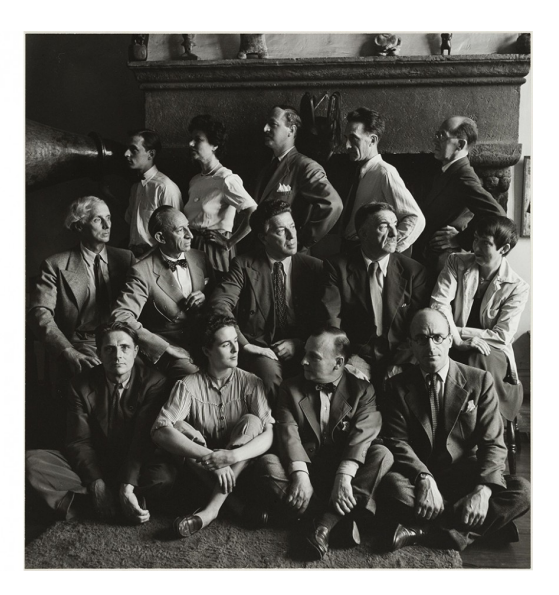
Fig. 1. Hermann Landshoff, Artists in Exile group photo of Surrealists, New York, 1942