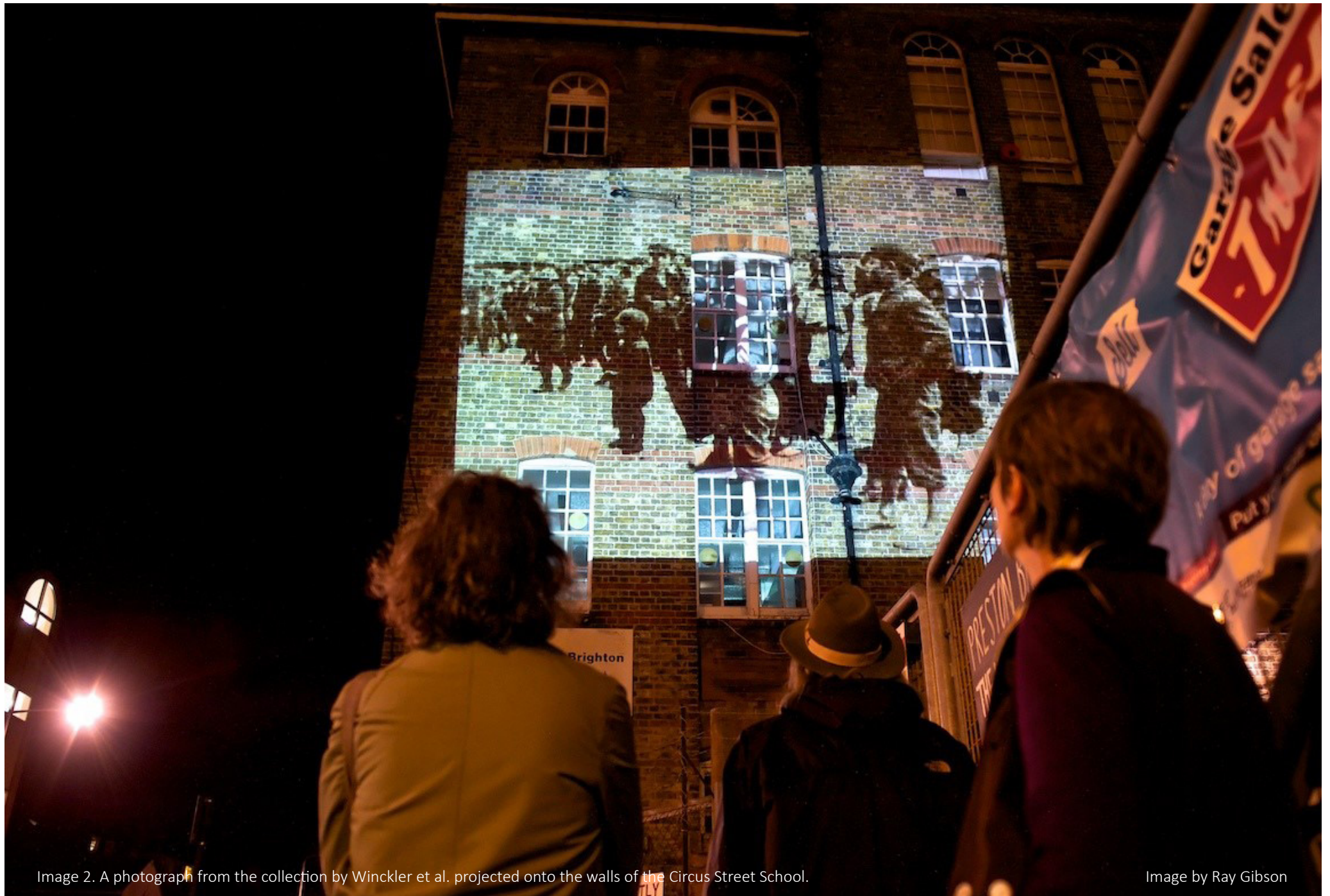
Image 2. A photograph from the collection by Winckler et al. projected onto the walls of the Circus Street School.