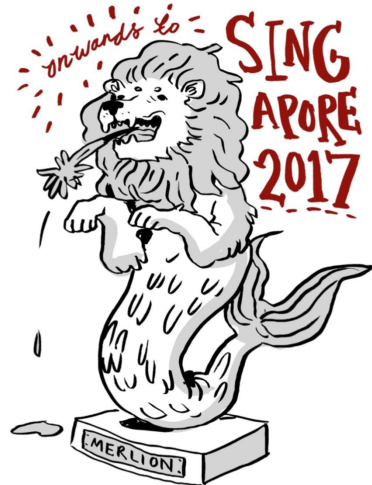
Image 6. Scriberia image of Singapore conference.