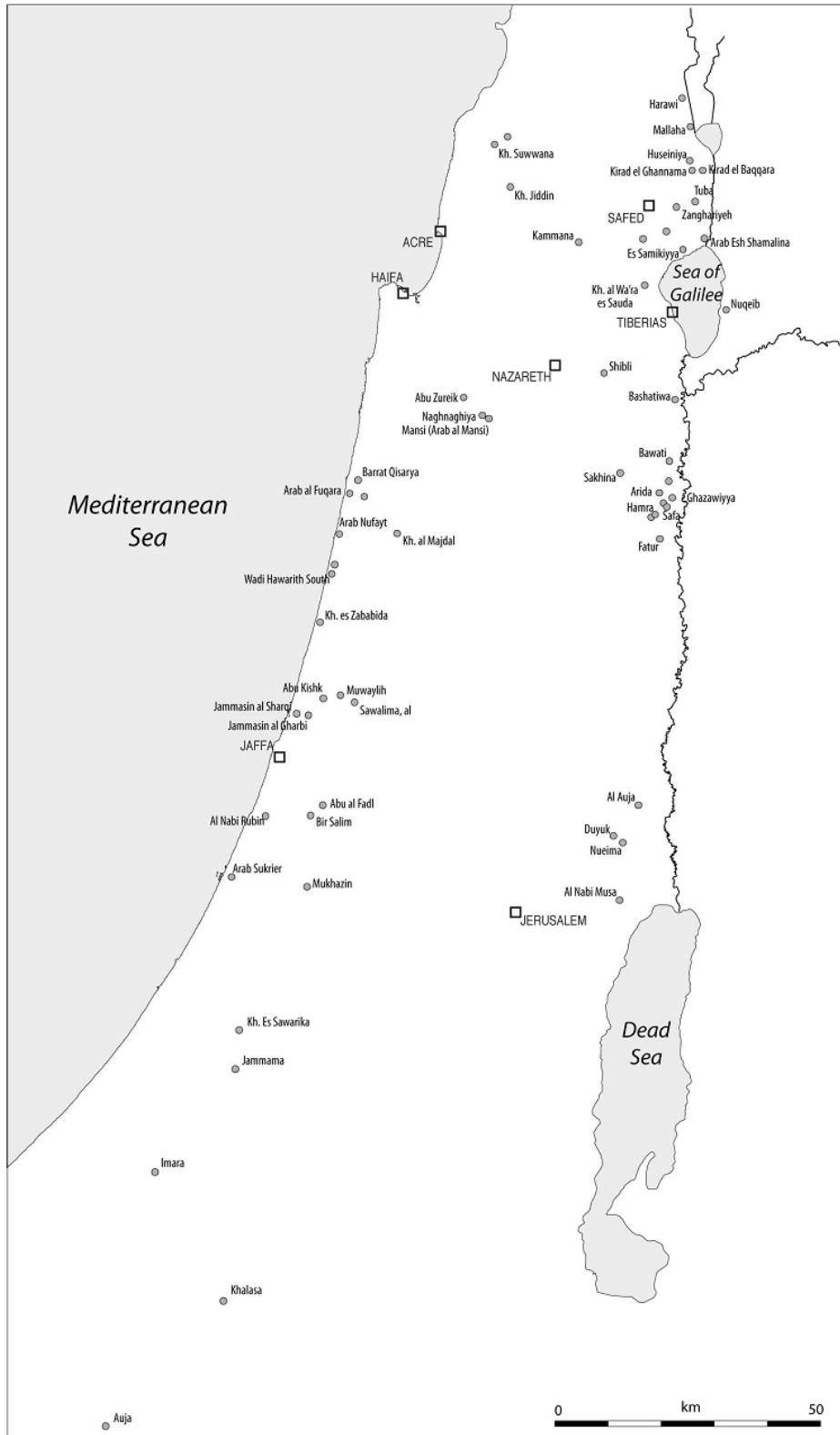
Figure 4: Map of Newly Established Bedouin Villages, 1945. Source: Frantzman, 2010.