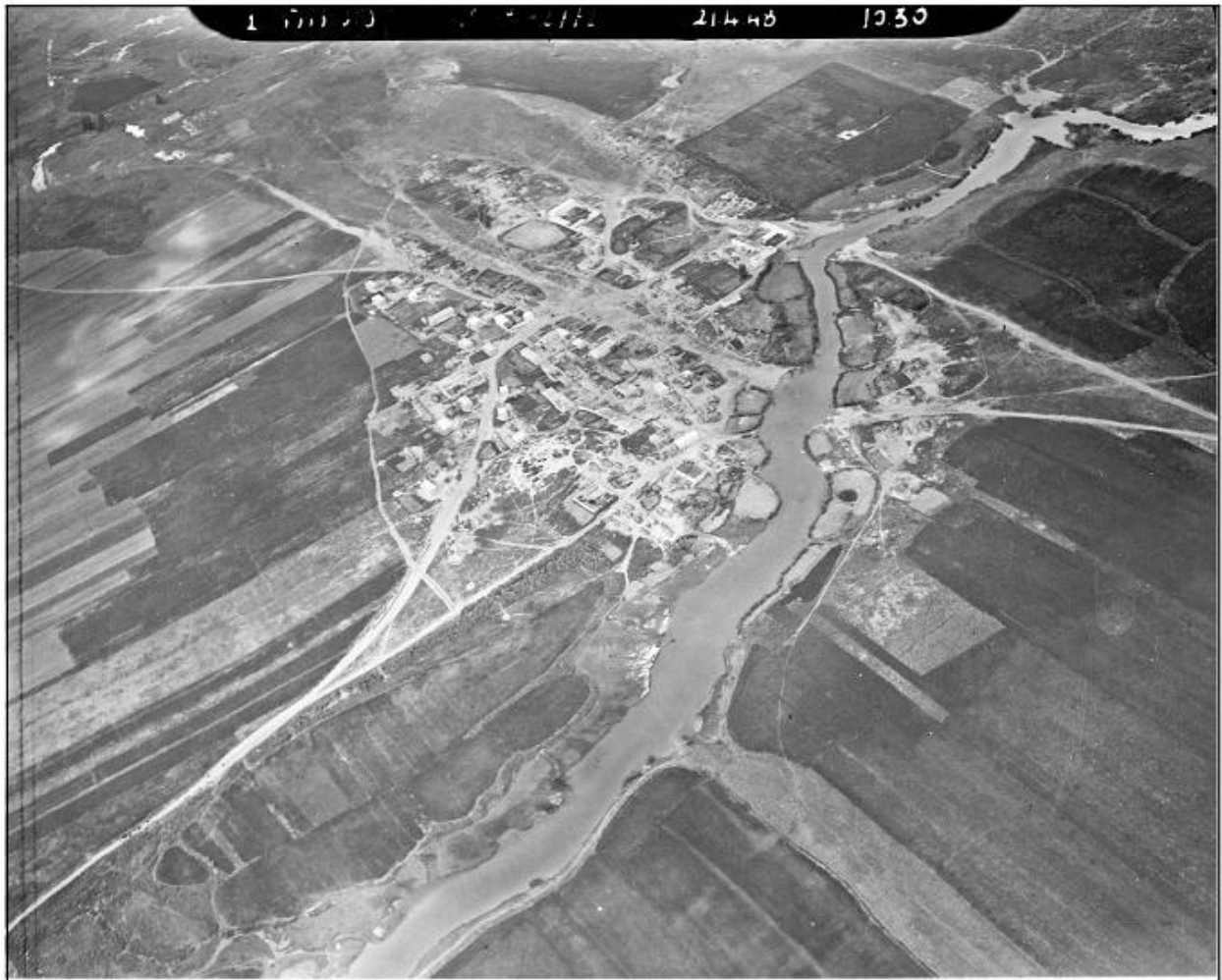
Figure 3: Aerial Photo of Mallaha, 1948.

In the Huleh valley, previously mentioned, the Ghawarina constructed a number of villages in the swamps. At the Mallaha springs the Arab Zubayd was one of these swamp dwelling tribes who built a small village in the area, which can clearly be seen in period photographs, with traditional thatched reed huts side by side with modern homes constructed of sheet metal and stone or mud-bricks.