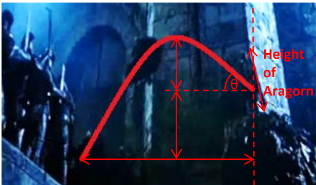
Figure 1) Estimation of parameters using the height of Aragorn as a scale. The path of travel was found using a series of screenshots from a video clip. Original video from [8].

Figure 1 shows a model of Gimli's flight, extrapolated from screenshots of the video clip. Aragorn's height is known to be 1.98 m tall [9]. Using this, the various distances required for the calculation could be found by scaling the image to Aragorn's height.