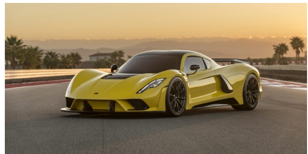
Figure 2 – Hennessey Venom F5 [1]

It does appear however that the trend of increasing top speed will continue for the immediate future, the Hennessey Venom F5 is set to be released within the next couple of years. This car is said to develop over 1600 hp and is projected to have a top speed exceeding 300 mph [1]. If these projections are true, this car will exceed 300 mph roughly 16 years earlier than predicted by equation 1. The trend of top speed will eventually plateau, but it appears that point may be further off then perhaps expected.