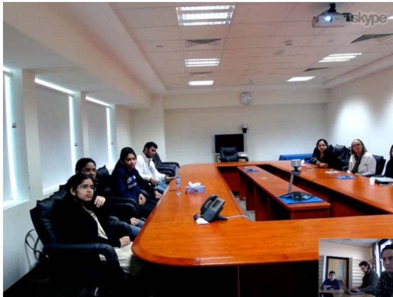
Figure 3 Cross-campus focus group discussion via video-conference.

Participants to this research experiment were volunteers who were recruited from the 2 nd and 3 rd year cohorts of the Computer Science department of Heriot-Watt University in the Edinburgh and Dubai campuses. Overall, 12 participants used the Web platform and 11 filled out the final questionnaire. The demographics for this final questionnaire were as follows.