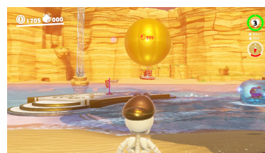
Figure 2: An image showing the full Odyssey with ship and balloon.

In Super Mario Odyssey, Mario appears to be two thirds of the height of a man in New