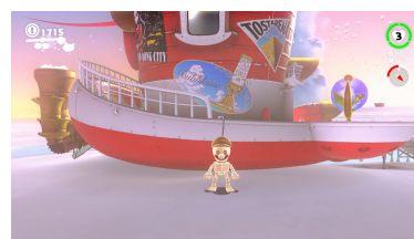
Figure 1: An image showing Mario standing next to the ship of the Odyssey.