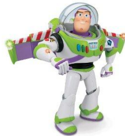
Figure (1): Buzz Lightyear [1].

The National Advisory Committee for Aeronautics (NACA), which was transformed into NASA in 1958, produced a series of NACA airfoils still used in aircraft manufacturing today [2]. Buzz's wings are modelled as a standard NACA profile, as shown in figure (2). This is an approximation, but allows experimentally determined values to be used for the wings' lift coefficient, C_L , and optimum angle of attack, \alpha .