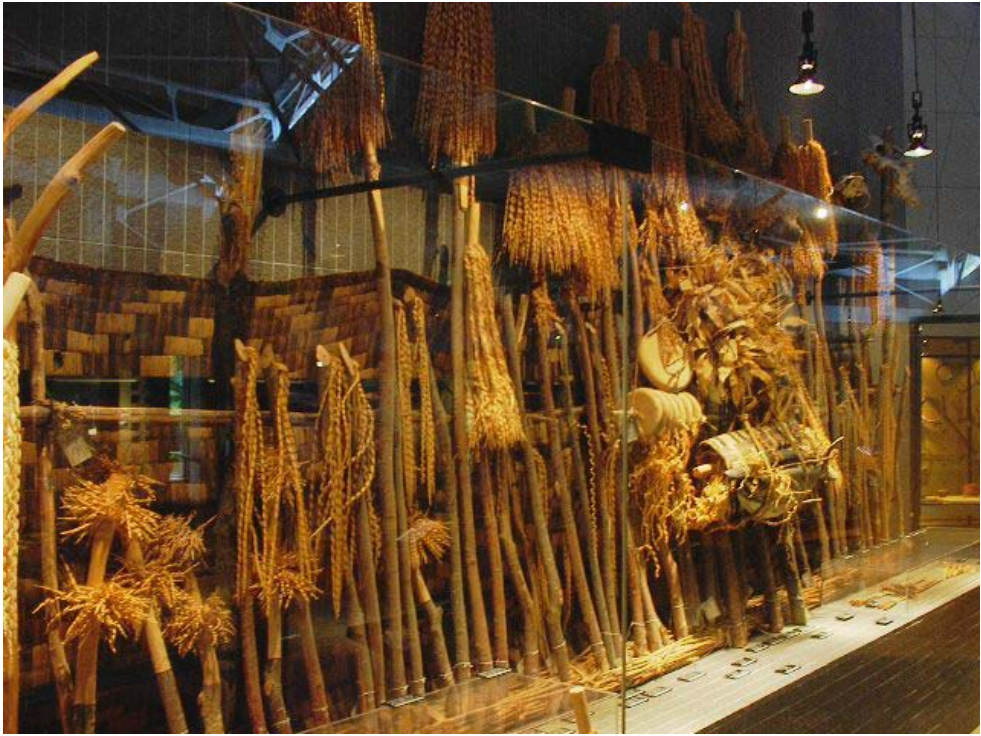
Fig 6. The exhibit of the Museum, Spiritual Culture , photograph by author, courtesy of the Nibutani Ainu Culture Museum