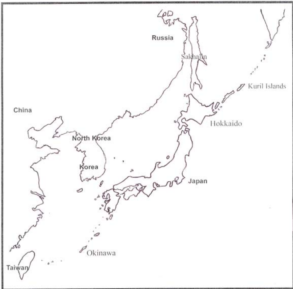
Fig 1. Japan and the surrounding, the location of Hokkaido