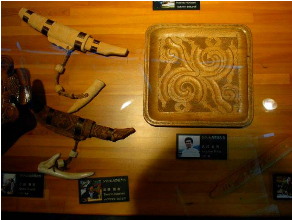
Fig 7. The exhibit of the Museum, Ainu patterns, photograph by author, courtesy of the Nibutani Ainu Culture Museum

The word Cluster indicated the basis from which Ainu culture spreads out and is transmitted whilst also promoting growth in the regional economy. The primary purpose of the Ainu Culture Cluster Project was the creation of this basis. During this process, the organizers thought it necessary to restore and preserve both material and non-material Ainu culture and to record the results of restoration and restorative processes. In the first year, 2002, previously unemployed people conducted an investigation into what traditional skills and resources are necessary for the transmission of Ainu cultural heritage, and they also restored a traditional Ainu house, ci-set as well as 171 artefacts. Since the curator thought that Ainu culture was closely connected with Ainu views concerning the spiritual and natural world they tried to follow the traditional construction process of ci-set precisely. This included a series of ceremonies such as those expressing gratitude to the gods. All of this was recorded. They also collected Ainu place names and Ainu motifs, and entered them into a database. In the second year 2003,