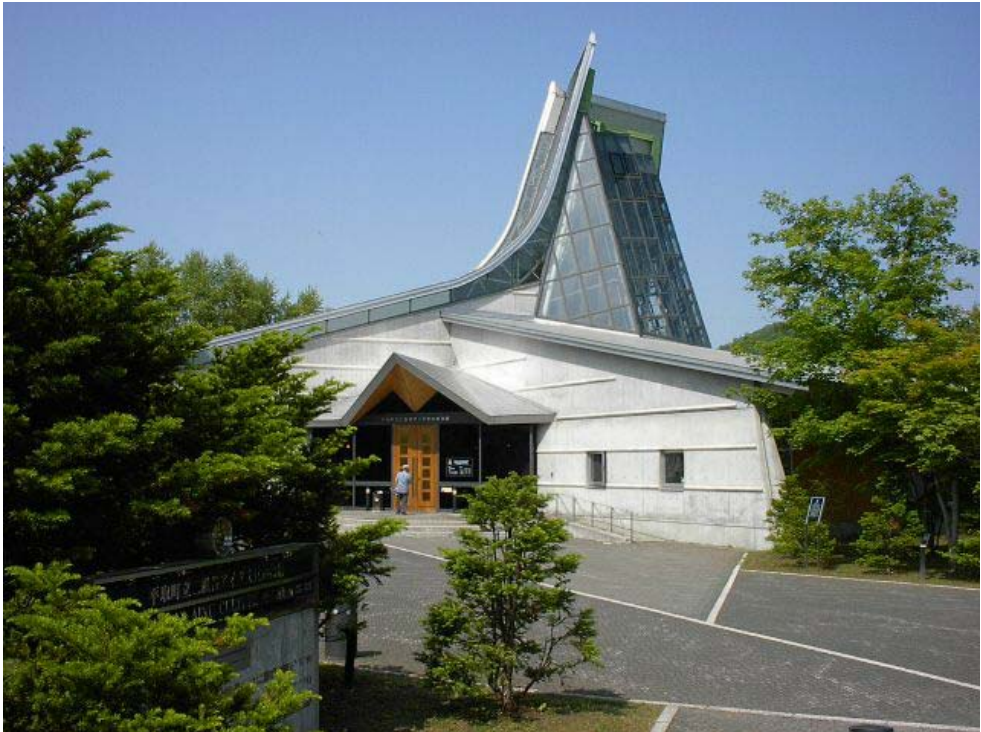
Fig 4. Nibutani Ainu Culture Museum

For instance, they stole Ainu artefacts, excavated graves and took skeletons as specimens, obtained blood for genetic investigation, and pulled clothes off people in order to confirm that they had 'hairy backs'. Kayano often witnessed such behaviour. To prevent these unprofessional activities and to preserve Ainu artefacts, Kayano started to collect them (Kayano 1990: 127). He went around Nibutani as well as the town of Biratori and bought as many artefacts as possible. His acquaintances wondered why he, a man who was not rich, spent so much money on 'useless' things. He believed, however, that these useless artefacts would be valuable in the future, and collected about 2,000 objects over 20 years (Kayano 1990: 138, 170). Since the artefacts occupied a huge space in his home and he worried about the threat of fire destroying his collection, he decided to establish a small museum. Supported by the town of Biratori and the Hokkaido Ainu Association, the Nibutani Ainu Shiryô -kan (Nibutani Ainu Culture Material Museum) opened in 1972, and the museum was transferred to town ownership in 1977 (Kayano 1990: 174).