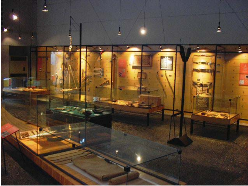
Fig 5. The exhibit of the Museum, Lifestyle, photograph by author, courtesy of the Nibutani AINU Culture Museum

Just behind the Historical Museum of Saru River, lies Lake Nibutani, an artificial lake formed by the Nibutani Dam construction. Nibutani also has some restaurants and AINU craftwork shops, and they are open all year round. Some restaurants offer AINU cuisine, such as deer meat and shito (lily root ball).