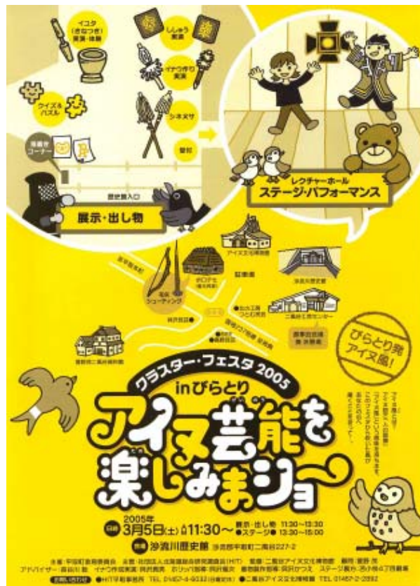
Fig 8. The brochure of the Kurasta Festa

In September 2004, the third and final year of the Ainu Culture Cluster Project started with many obstacles needing to be overcome. For example, at the beginning, only four local residents were hired though the HIT recruited fifteen. There were not enough documents available to provide for an authentic restoration i-oman-te . Furthermore, some people believed that misfortune would occur unless the tradition order of the ritual was observed exactly and some that the very planning of i-oman-te itself might bring misfortune. Old people were hesitant to participate is interviewees since they had experienced discrimination in their lives. Although these problems often brought the organizers to a standstill, they were not pessimistic about the restoration of i-oman-te , and considered the year 2004 as a first step in Ainu cultural promotion