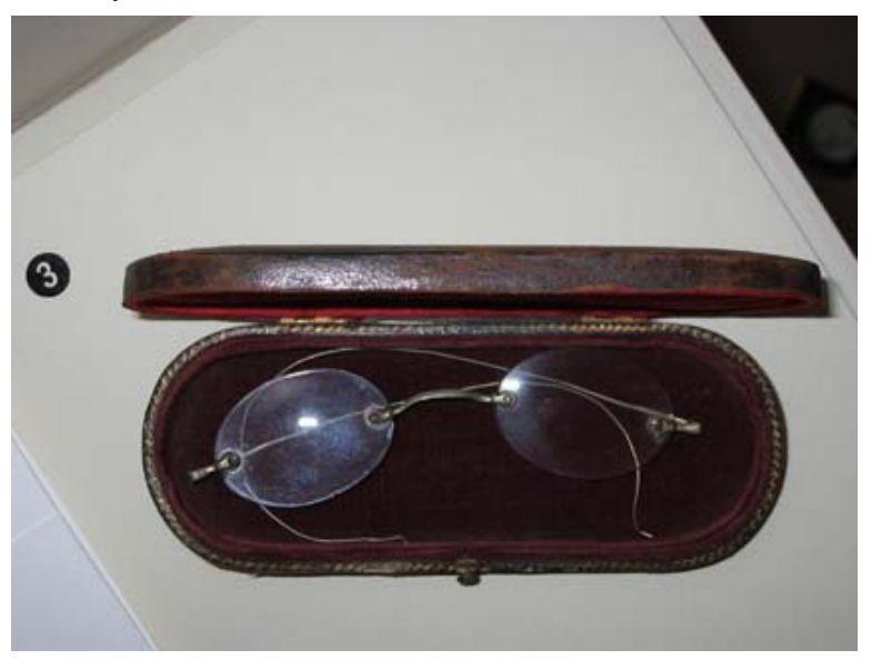
Fig. Glasses in leather case belonging to Gregor Mendel.

The material selected for the exhibition included a relatively small variety of objects including personal items, such as Mendel's glasses and walking stick, a portrait of Mendel as Abbot of St Thomas, various certificates and other documents. In order to convey the intellectual context in which Mendel lived and worked, as well as to create a dialogue with the setting in which the exhibition was placed, we included material that was broadly linked to the Abbey and that illustrated its rich intellectual life. Hence, in the first section of the exhibition, a library catalogue dated 1755 figured alongside a biblical commentary with its pages opened to display a sacred genealogy, a group photograph of the friars including Mendel, and Mendel's certificate of ecclesiastical studies. Similarly a microscope and box of slides which were part of the teaching material in the Abbey were shown alongside plates from a herbarium, a floral book, pruning tools and a list of seeds ordered by Mendel for the Abbey. Although none of these items had an immediate relevance in illustrating Mendel's scientific achievements and his research method, they nonetheless helped to create a biographical setting and to introduce the rest of the exhibition. They also hinted at Mendel as a friar and a teacher.