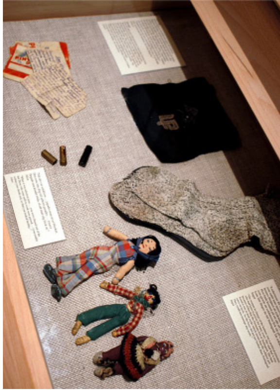
Fig. 4 Artefacts in the 'Sabotage' cabinet. Clockwise from top: writing on bulb cartons, a black fabric handbag, "sabotage socks," dolls for smuggling messages, and lipstick for rouging "life" into one's face.

From the prospect of an intimate encounter with a 'difficult' exhibit, what possibilities do the AIDS and Ravensbrück exhibitions offer through their presentation of both gift and demand? The lived experience of AIDS or HIV infection, or the remembered experience of women survivors of Ravensbrück, are worlds apart from the personal experiences of the vast majority of visitors who have come to see these exhibits. Conceived not as spectacles of suffering, but as testamentary encounters with the traces of these experiences, these exhibitions challenge visitors in very different ways to come into a relation of significance with lives lived on terms very different from their own.