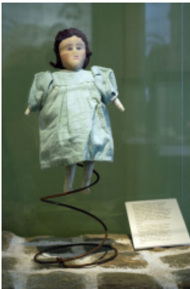
Fig. 5 A doll fashioned from scraps of smuggled cloth, used as a gift for children in the camp.

Divergent experiences are also evident in the exhibition Surviving . However, here various experiences are manifest through the material objects on display rather than in the proliferation of quotes from interviews with former inmates. While the objects are framed within thematic categories that threaten to reduce them to illustrations of these themes (for example, Sabotage, Practical Objects, Memorabilia), the material details of many of these objects break the confines of such categorization. This is so even at times when accompanying text attempts to pin down the representational significance of any given artefact. For example, in the cabinet titled 'Religion/Food for the Soul,' a collection of rosaries fashioned out of berries, grains and bread crumbs is accompanied by a quotation that reads: 'All prayer was strictly forbidden in the camp. If any German saw you praying, you got a terrible beating and were brought to the punishment block....'. While this quotation attempts to underwrite the meaning of the objects one sees, the objects themselves offer an