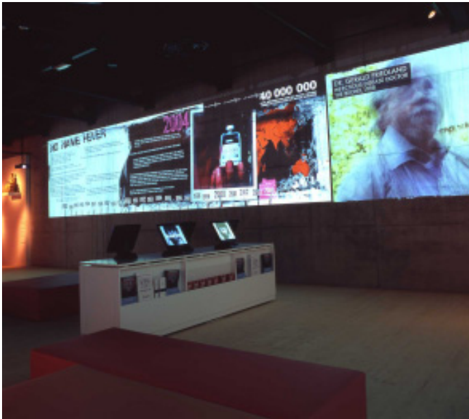
Fig. 1 AIDS Timeline & video clips, with computer terminals below.

In December 2004, the Museum of World Culture opened its doors to the public, having dramatically reinvented itself from its former identity as the Ethnographic Museum of Gothenburg. Committed to tackling the problematic colonial heritage of its collections, the museum envisioned itself as 'a place for dialogue, where multiple voices can be heard and also controversial topics can be raised - an arena for people to feel at home across borders' (Museum of World Culture 2004). No Name Fever: AIDS in the Age of Globalization was one of five inaugural exhibitions presented at the museum opening in December 2004; it ran for almost eighteen months, closing in June 2006. The topic of AIDS fit well with the museum's mission to emphasize interdependencies and connections across geographic boundaries, and the need for global responses to global problems. Recognizing the exhaustion of interest in the topic of AIDS in Sweden, museum staff consulted extensively with youth target audiences to inform their approach. The result was a youth-centred exhibition that combined personal narratives with art, film, installations, music, photos and promotional material by artists, activists, policymakers and everyday citizens who have worked to fight the silence about HIV/AIDS.