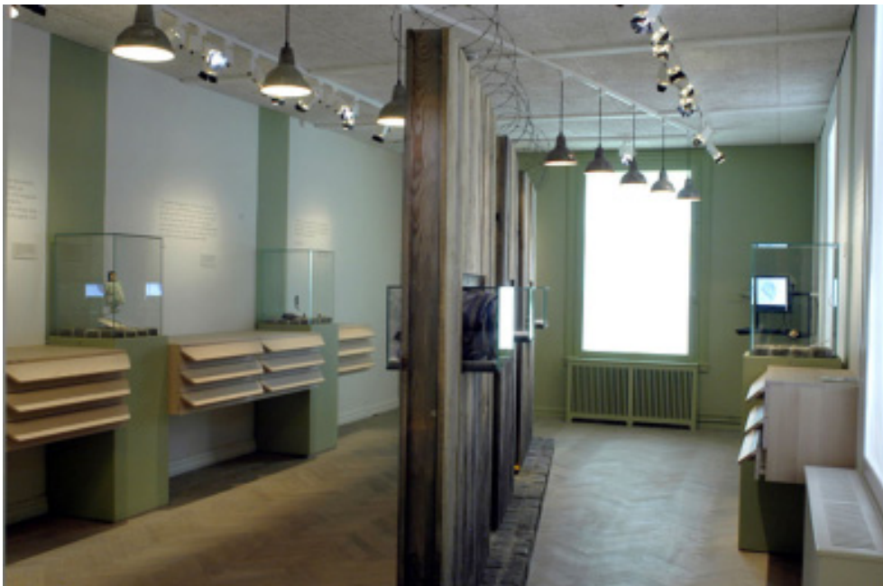
Fig. 3 View of exhibition from entrance.