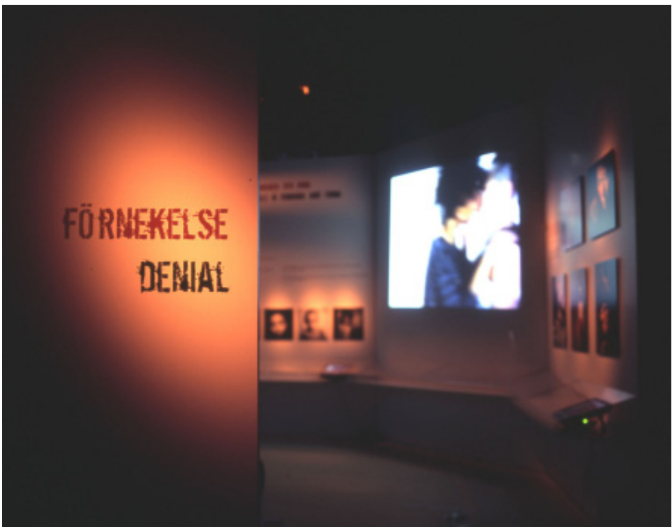
Fig. 2 Entrance to the Denial Polygon.

polygon presented a range of texts, images, and objects thematically organized as different emotional responses to the disease: denial, fear, anger, desire, despair, sorrow, and hope. Conscious of the differences between rich and poor countries in the spread and effect of AIDS, museum staff attempted to find a way of addressing the disease that would resonate with experiences in the North and the South. Emotion was seen as an avenue that cut across the rich and poor divide, providing a point of connection between the variously located human experiences presented in the exhibition, and between these and museum visitors. As Sandahl explained: 'Individuals can relate to another's grief, or sense of hope'. In the interior of each polygon, curved white walls formed a backdrop for still images, video screens, and object display cases. Art, photography, posters, multi-media installations, film and other objects reflected the impact of HIV/AIDS on various continents. While each room in the exhibition contained objects of some kind (for example, a dress made of condoms, a collection of handcrafted dolls made by South African women infected with HIV/AIDS), images and multimedia presentations predominated.