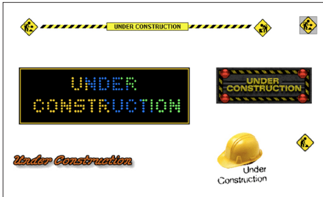
Figure 4. Examples of under construction GIFs.

meaning in a single GIF. This symbolic complexity makes them an ideal tool for enhancing two core aspects of digital communication: the performance of affect and the demonstration of cultural knowledge. The combined impact of these capabilities imbues the GIF with resistant potential, but it has also made it ripe for commodification. The adoption of the GIF for commercial purposes demonstrates the recognition of these key features and highlights how the GIF has transitioned from a user-driven format within niche digital cultures to a visual device with institutional applications and investment. In the pages that follow, we outline and articulate the GIF's features and affordances, investigate their implications, and discuss their broader significance for digital culture and communication.