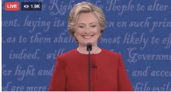
Figure 1. The “Hillary Shimmy” GIF.