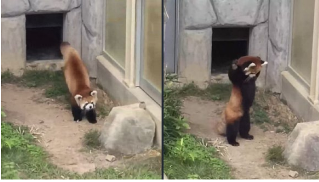
Figure 5. Red panda surprised by rock.

(Planas, 2015). However, the use of these popular public figures and texts does not necessarily mean that the committee was representing their views; indeed, Jennifer Lawrence has been particularly outspoken regarding her distaste for the Republican Party's policies. 5