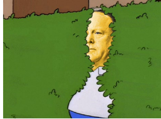
Figure 3. Sean Spicer as Homer Simpson disappearing into bushes.

The Hillary Shimmy (Figure 1), for example, highlights these multiple levels of meaning. On the surface, stripped of all context, the shimmy is an animated image of a well-dressed, well-groomed woman standing at a podium shaking her shoulders while smiling to herself. While the action captured in the GIF would make it useful to communicate a variety of emotions or affective states (anticipation, self-satisfaction, sauciness, and so on), those who understand who the woman is (the first female American presidential nominee, US Senator, former First Lady) and the context of