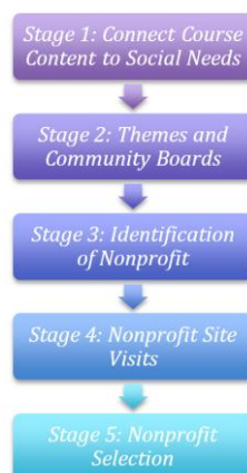
Figure 2.: The MSPP process.

An award ceremony is held at the end of each semester in which professors and some students from Mayerson classes convene with representatives from the chosen nonprofits to present the grant awards. At this time, professors, students, and nonprofit representatives reflect upon, and most importantly celebrate, the positive impact of the Mayerson experience.