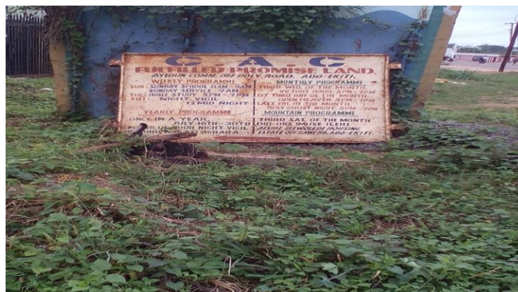
Pic 4.4.2 Item showing highlighted use of English and Yoruba languages

Another instance of bilingual expression is its use to highlight and consequently draw attention to important information on a sign, with aliases/appellations and brand names to distinguish the branch of a religious sect.