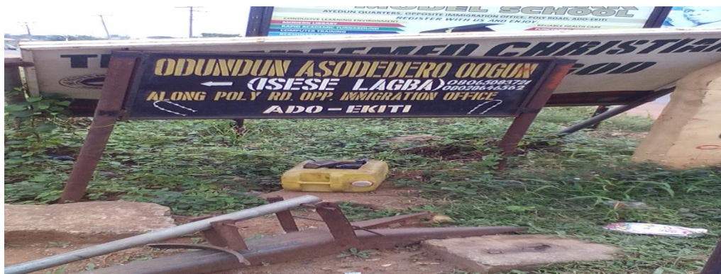
Pic 4.6.1 A monolingual ATR sign written in Yoruba

This sign features an almost exclusive use of the Yoruba language (except for contact information), which evinces loyalty to the indigenous language as the language strictly to be used in carrying out ATR-related activities.