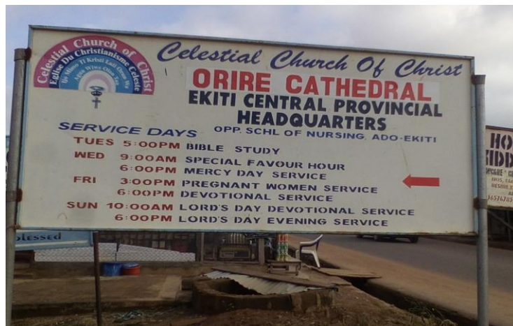
Pic. 4.4.1 LL item with multilingual logo and appellation

There are very few cases of bilingual presentation of information in the signs. In Table 1.0, there are 5 (9.44%) bilingual LL items out of the total Christian-related signs. We have the following instances: