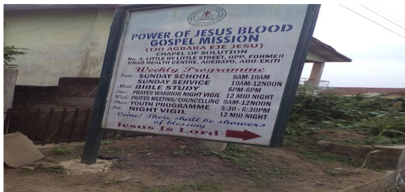
Pic 4.4.4 A bilingual church signboard with translation of brand name

This LL item shows the use of more than one language where the Yoruba version is presented as the major language in font size, colour and prominence, while the English version is presented as a translation of the major information. The other use of Yoruba is to present the particular name of the programme being advertised, and this is not translated: ERI AMONA 2015 . This reflects a power tussle between the two languages. On the one hand, the Yoruba language is presented to attract the audience's attention to the originality of the programme while the English language is used to announce the sophistication of the sign producer.