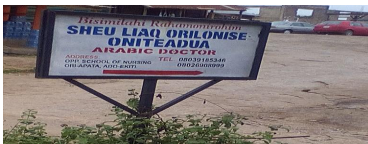
Pic 4.5.2 Item with re-orthograped Arabic signal, advertising the private practice of an Islamic cleric

There are 4 Islamic related signs for this study. All the signs used in this study are signboards. One (25%) of them is used to announce the presence of a mosque while three (75%) are advertising the business of Arabic/Islamic doctors. The LL item announcing a mosque is a top-down sign in that it is produced by a constituted authority, while the others are bottom-up signs. In Table 2.0, all the signboards have bilingual information. Two of the signs have texts in Arabic and English (see Pic 4.5.1, Pic 4.5.4), one is produced with Arabic and Yoruba texts (see Pic 4.5.3), while the other has the combination of the three languages (see Pic 4.5.2). Two signboards (50%) have their introductory information (signal) in Arabic but none in English (see Pics 4.5.1 and 4.5.2). The consistency of Arabic on all the Islamic-related signboards as signal, name and alias show the inherent connection of the language to the religion.