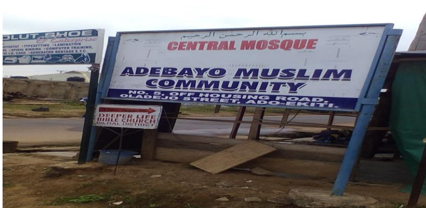
Pic 4.5.1 LL item with Arabic signal, announcing the presence of a community mosque

There are 4 Islamic related signs for this study. All the signs used in this study are signboards. One (25%) of them is used to announce the presence of a mosque while three (75%) are advertising the business of Arabic/Islamic doctors. The LL item announcing a mosque is a top-down sign in that it is produced by a constituted authority, while the others are bottom-up signs. In Table 2.0, all the signboards have bilingual information. Two of the signs have texts in Arabic and English (see Pic 4.5.1, Pic 4.5.4), one is produced with Arabic and Yoruba texts (see Pic 4.5.3), while the other has the combination of the three languages (see Pic 4.5.2). Two signboards (50%) have their introductory information (signal) in Arabic but none in English (see Pics 4.5.1 and 4.5.2). The consistency of Arabic on all the Islamic-related signboards as signal, name and alias show the inherent connection of the language to the religion.