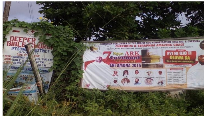
Pic. 4.4.3 LL item with varying degrees of bilingual presentation of information

For church banners, there is only one instance of bilingual expression found in an aspect of the LL item.