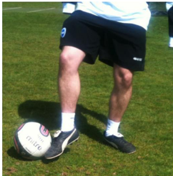
Figure 1: Position of knee at the time of injury.

knee pain but with some improvement. He was able to jog for 12 minutes despite discomfort. Patient 2 was reviewed at 20 days post injury. At this time, he was also able to run for 12 minutes at a time, but continued to complain of lateral knee pain. Both patients exhibited the same examination findings. There was no knee effusion and a full range of movement without pain. McMurrays's, Thessaly, Lachman's, sag sign and pivot shift tests were negative. Tests for medial collateral ligament were negative. Testing of the lateral collateral ligament with a varus stress test did not produce pain and there was not increased laxity. There was tenderness superior to the fibular head. Of note, however, pain in both patients was reproduced in long-legged sitting with the left leg crossed over the right at the ankle (Figure 3). Ultrasound examination of both patients revealed a thickened and hypoechoic lower portion of the LCL. They then continued their rehabilitation under their football club's medical team.