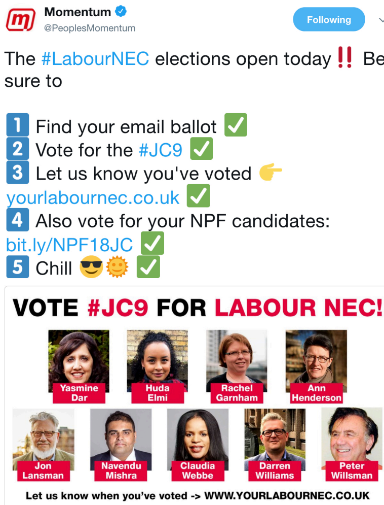
Figure 1. An example of members being instructed to vote in the NEC elections

The most frequent posts across the national pages were to instruct members to undertake an action on the request of the leadership. As Figure 1 illustrates, this predominantly focused on calls for supporters to vote for Momentum-backed candidates in elections to the National Executive Committee (NEC), the governing body responsible for setting the overall strategic direction of the Labour Party. These requests were often made with messages designed to resonate with a supporter's sense of efficacy. This included examples of when its membership base had previously had their involvement constrained, referring to the decision by the Labour Party executive to charge £25 for registered supporters to vote in the 2016 leadership election, compared to £3 in the vote a year earlier (Momentum, 2018g). The group also appealed for possible future involvement, claiming that the #JC9, the nine Momentum-backed candidates, were needed to democratize decision-making in the party (Momentum, 2018f).