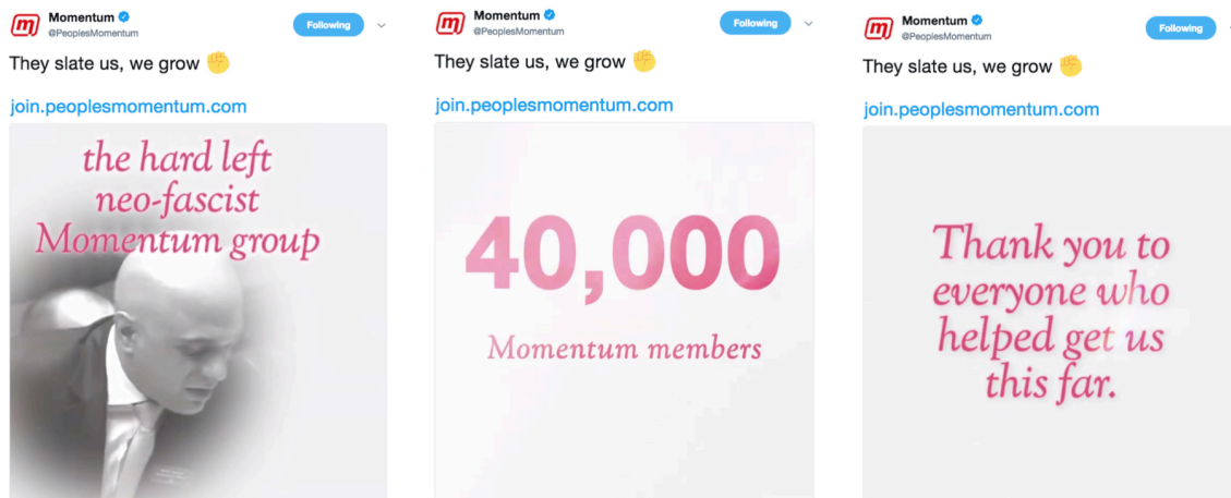
Figure 3. An example of Momentum using media criticism to foster a collective identity

democratic, grassroots-led Labour Party. Ultimately, this helps to shape the group's identity by defining what they oppose.