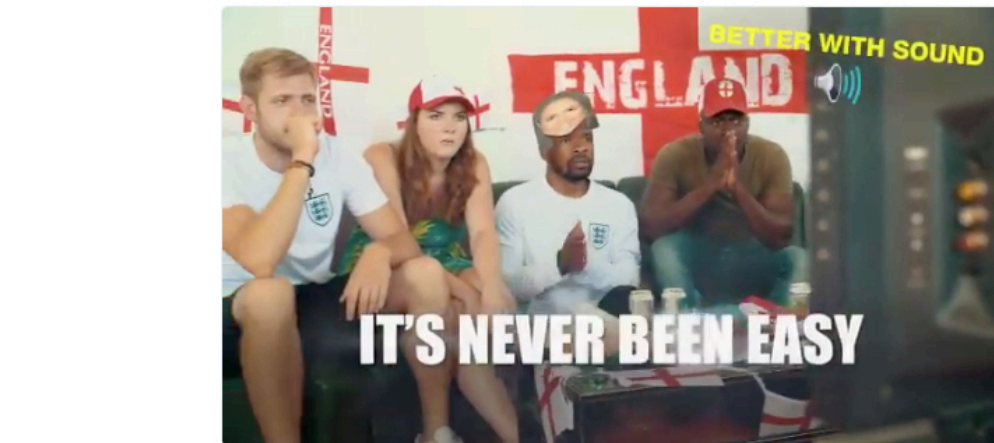
Figure 4. A video designed to support requests for member participation

What links these videos is the style of communication. The leadership draws on a youthful, digitally-enabled civic vernacular that exists online. Whereas party political campaigning online often replicates professional norms refined across other media (Lilleker et al. 2017), Momentum embraces the humour and irony that typifies the social web. Interviewees identified this communicative style as a distinguishing feature of the group’s social media presence, something distinctive that members can mobilize around (e.g. Interview 1; Interview 2; Interview 5, July 2018). “Tiago” (Interview 16, February 2019), a supporter from London, recognizes the value of these videos in achieving this: