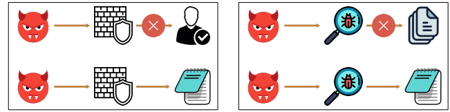
(a) Ransomware’s messages to high IL applications are blocked by UIPI (top); but ransomware can send messages to trusted applications (bottom). (b) Ransomware’s write attempts to protected files are blocked by AVs (top); however, sending messages to trusted applications is allowed (bottom).

controlled write operations as to encrypt inaccessible protected files. The attack is described in more detail in the next section.