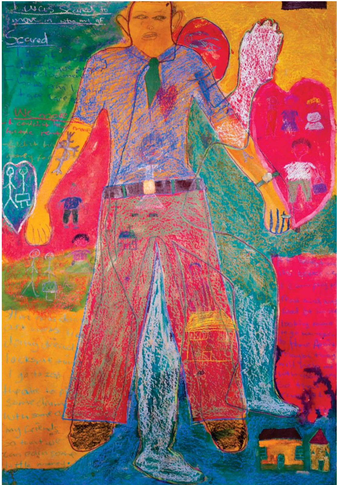
Josco's body map: Queer Crossings