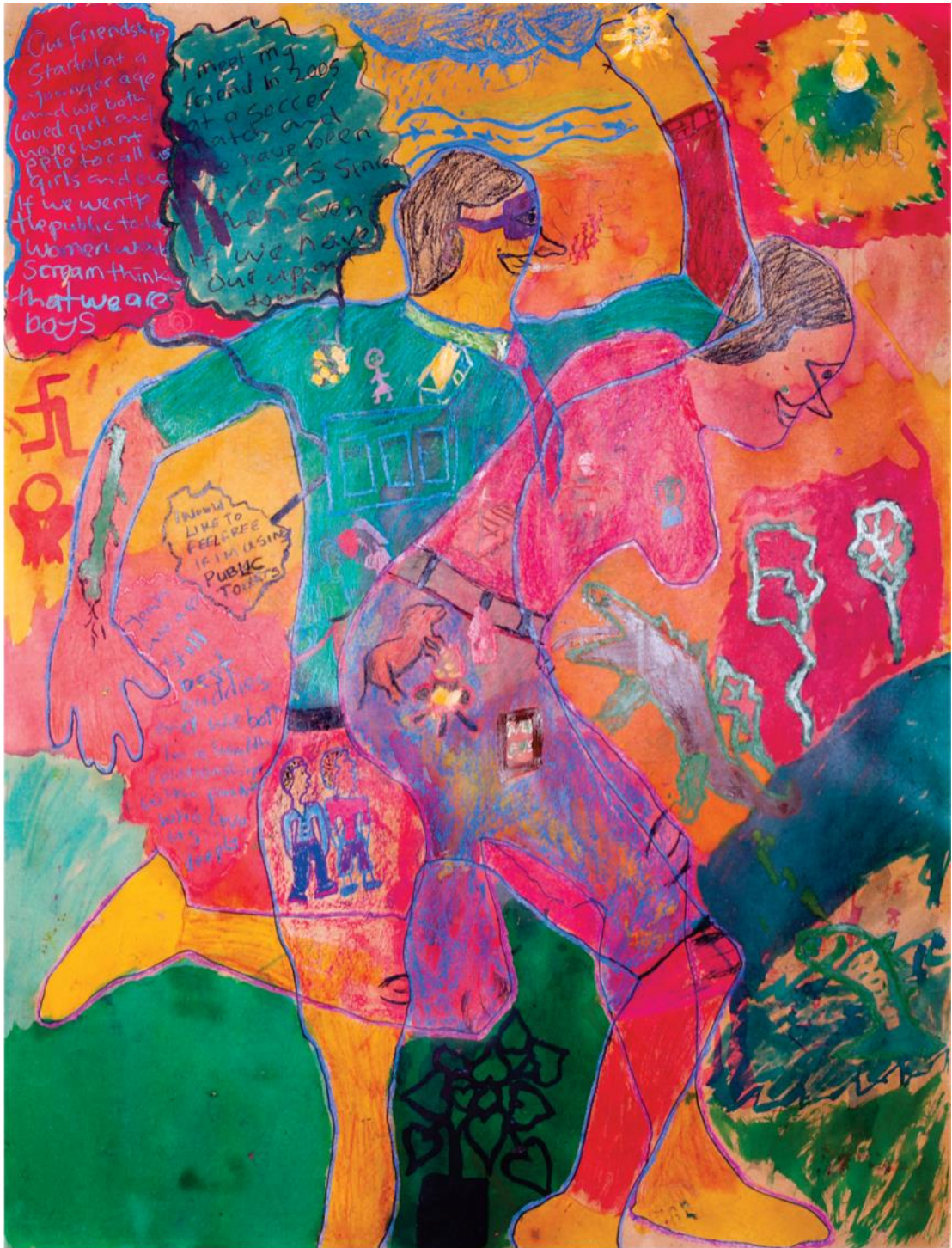
Hotstix's body map: Queer Crossings