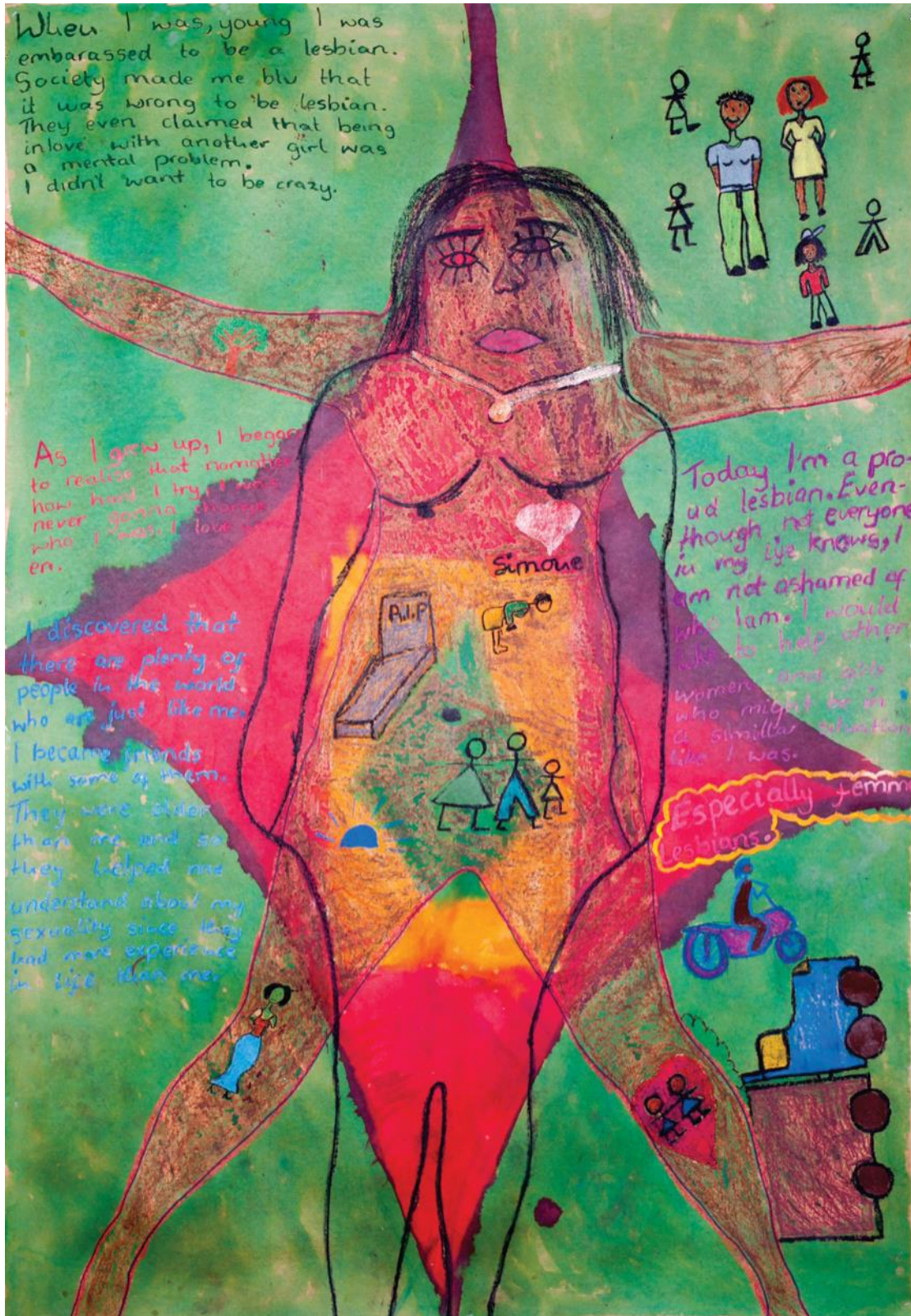
Petunia's body map: Queer Crossings