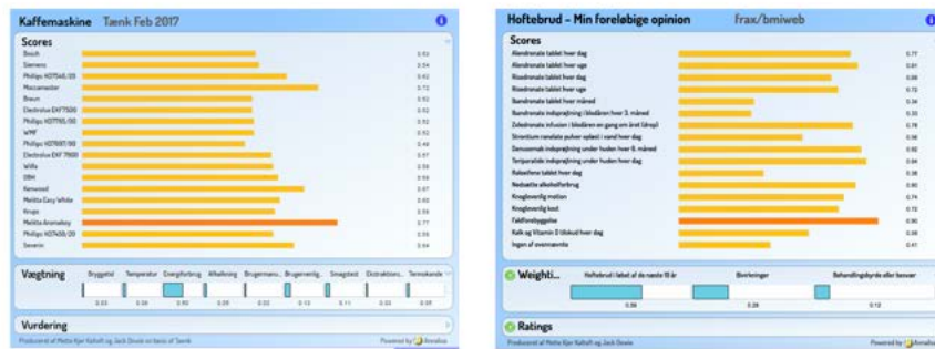
Figure 2 Comparison of Annalisa output screens for Taenk coffee machine comparison and fragility fracture decision support tool

the complete separation of preferences and evidence mandatory in MCDA, to avoid their algorithmic synthesis into a numerical score (opinion) for each option, and to avoid the consequent potential exposure of, and need to accept and resolve, dyadic discordance. In contrast, proponents of nac prefer to avoid the confounding of preferences and evidence almost inevitable in vdr; prefer to see the result of the algorithmic synthesis of preferences and evidence in a numerical score (opinion) for each option and prefer to expose, discuss and transparently resolve any dyadic discordance.