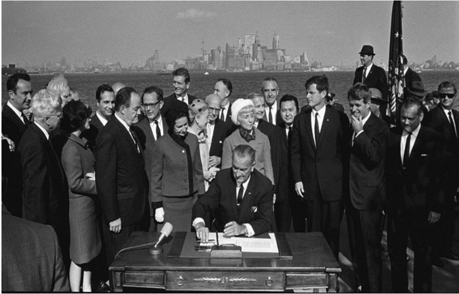
The saddest day in US history. President Johnson, with two Kennedys and ex-President Hoover, gives America to Mexico - Oct 3rd 1965