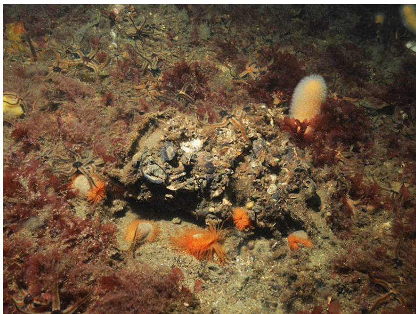
Limaria hians beds in tide-swept sublittoral muddy mixed sediment