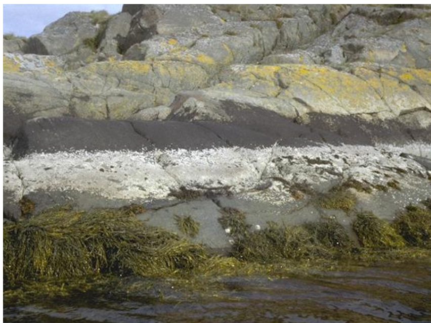
Verrucaria maura on littoral fringe rock