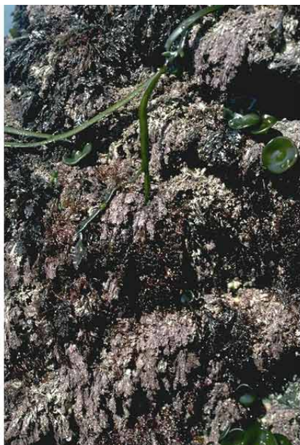
Close up of rock face with Corallina and Himanthalia (ELR.Coff).