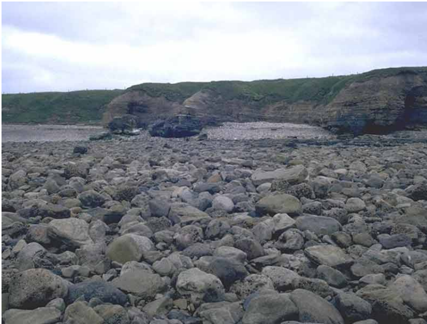
Boulder shore backed by low cliffs (SLR.Bllit)