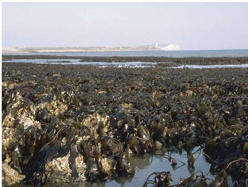
View across shore showing extensive kelp beds on chalk.