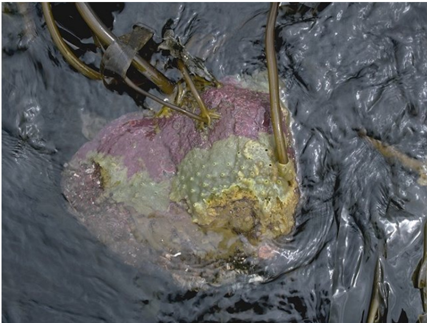
Laminaria digitata, ascidians and bryozoans on tide-swept sublittoral fringe rock