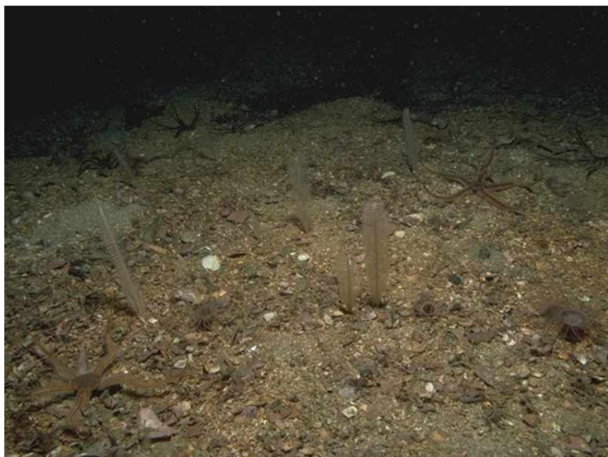
Virgularia mirabilis , Cerianthus lloydii with Ophiocomina nigra on shelly muddy gravel.