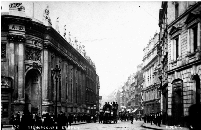
Figure 5. Exterior view of Gibson Hall, 1900.

The theme of history and reference to an ancient past appeared on the outside of the building as well as the inside. On the exterior, statues on the building's edges and relief panels borrowed much from the style of the ancient past. It resembled art forms apparent in temples and places of worship where sculpted images of deities and other mythological figures appeared as standalone pieces and on the architecture itself. The commissioners, architect and designers of Gibson Hall did not reproduce images from the past directly as the figures were not cast as Greek or Roman gods and goddesses. Yet, despite reconfiguring classic art for a contemporary audience, there were certain hallmarks and clues which indicated a clear lineage to the classical past. It was particularly common for personifications of commerce and industry to garb classical costumes and poses (Grissom 2009, 211). The characters displayed in the statues along the top of the exterior of the bank in Figure 4 appeared as classical sculptures. All were women with a melon hairstyle and bun at the nape of the neck. This was the hairstyle of mortal women of high status in Roman iconography (Trimble 2011, 47). The women stood with their arms closed in a steady pose with little