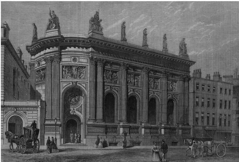
Figure 4. Exterior view of Gibson Hall, Illustrated London News , 1866.

Since Greek temples based on this form had existed for thousands of years, it gave the message of trustworthiness. It was also a form associated with power and dignity, but in this instance transferred by association from a Greek god or goddess to the particular financial house. The message of power is still important: the architecture, scale and style of large and expensive office blocks are intended to convey commercial power (Conway and Roenisch 2005, 181).