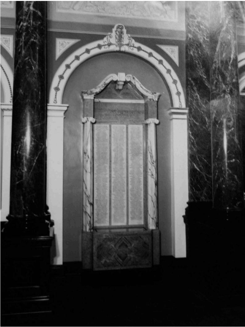
Figure 8. War memorial.

Other banks also built similar memorials. For example, the chairman of Lloyds Bank unveiled a monument to bank staff killed in World War One in 1921 at the bank's head office on Lombard Street (Gough 2004). The Bank of England also commemorated those members of staff who lost their lives in these conflicts (Barnes and Newton 2018b). In the case of National Provincial, the head office banking hall was updated to remember and commemorate those who died in these global conflicts, but the new structures maintained the style, opulence and grandeur in the original Victorian design. In this sense, the memorial did not communicate National Provincial's special status or the extraordinary contribution of its staff to the war efforts. Rather, the war memorial ensured that it was in keeping with images and symbolism of its competitors and, more broadly, of nation state monuments. The commemorations and messages about their staff and their competency