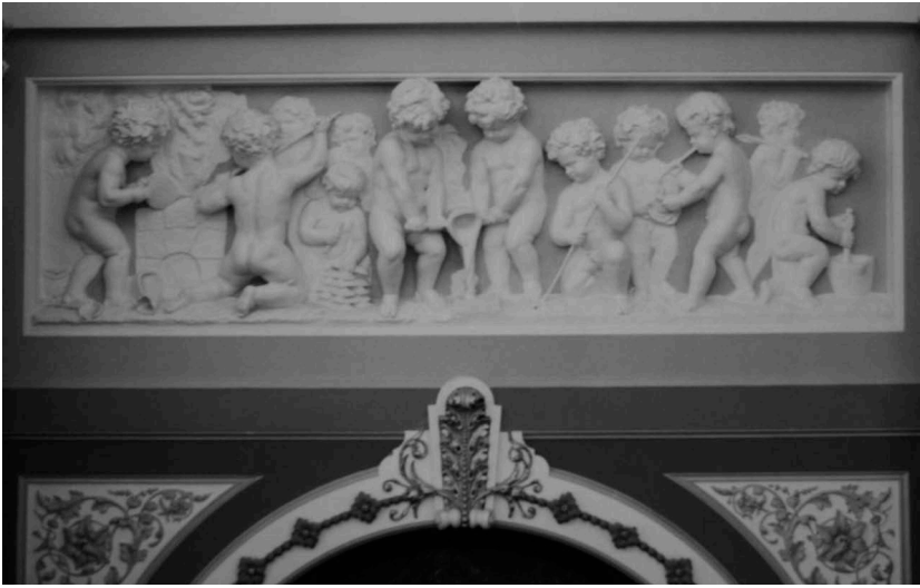
Figure 6. Doorway panel.

again through its branch network. In turn, this generated the bank's wealth. Reports at the Annual General Meetings of the National Provincial outlined the prevailing economic conditions, and how fluctuations in the economy had an impact on bank performance. 43 The images displayed on the bank's new head offices clearly showed the constituent parts of its provincial network, and their key commercial activities.