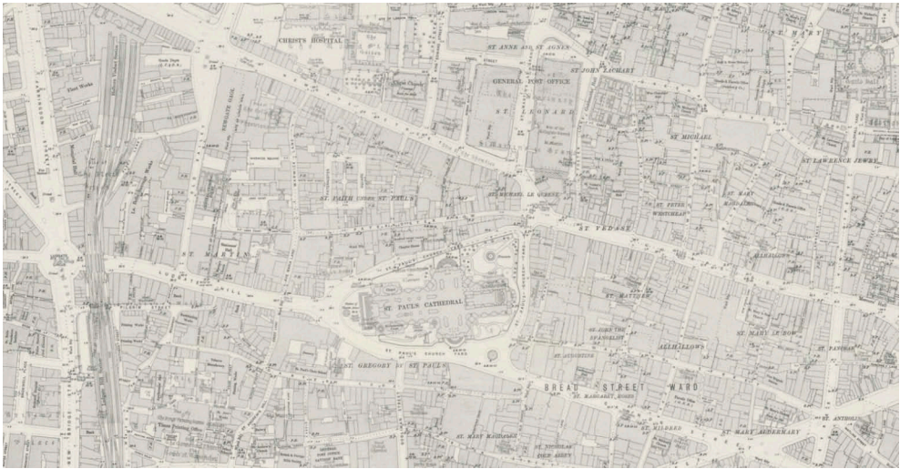
Figure 2. Ordnance Survey Map, London, 1895.

deliberately contrasted in style from the private banking-houses and their more ‘domestic’ architecture (Abramson 2005, 187).