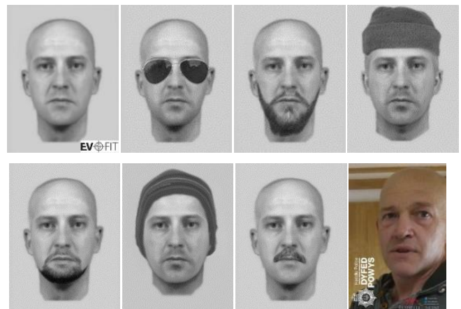
Fig. 1. EvoFIT facial composite (top far left) with plausible likenesses created to brief officers hunting for murder suspect, bottom far right. Upon arrest, the suspect had grown a beard: his appearance resembled the third depiction, top row.

Further research on the initial interview stage indicates that naming of PRO-fit and EvoFIT composites increases if the constructor is asked to recall the environment in which a target face had been seen [16][17]. This is because there is benefit to face recall and construction from additional cues that a witness remembers from the environment (crime scene). In another project, EvoFIT composites emerge more identifiable if constructors are asked to ignore width of face rather than an alternative (previously-used) method where witnesses selected a single face for width at the start and the system generated faces based on this selection [18]. Further research, as mentioned above, has developed post-production techniques that improve naming of finished composites. The approach includes presenting a composite (i) in a moving caricature (facial feature exaggeration) format, (ii) by turning the face side-on (to produce a stretched image) and (iii) by adding a hat, sunglasses and possibly other accessories such as facial hair (to conceal inaccuracies in the composite) [14][19][20]. These techniques can be very effective. For example, a range of plausible appearances were created for a recent criminal investigation to help the police identify a murderer at large [22], as illustrated in Fig. 1.