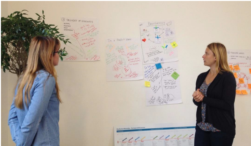
Figure 4: Sharing and discussing brainstorming ideas

living in a familiar world. In small teams of two participants each of these four issues were explored further by sharing knowledge. Conclusions were noted and shared.