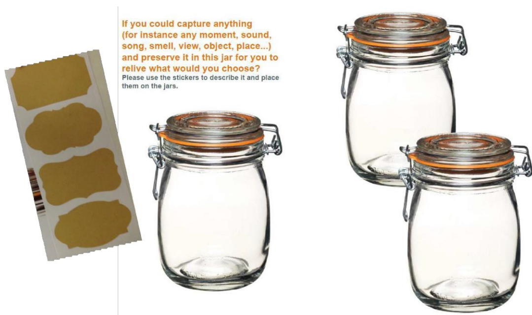
Figure 2: “Do books” exercise about preserving important moments in people’s lives

Fifteen do books were distributed over three countries, Germany, the Netherlands and Spain. They remained the property of the participants but anonymized pictures were taken of the results for analysis. First results promise valuable insights into decision making and attitudes with respect to future plans of people with dementia.