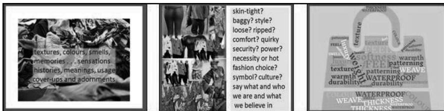
Figure 2: Talking About Textiles: relationships, actions and activities explored in the workshop