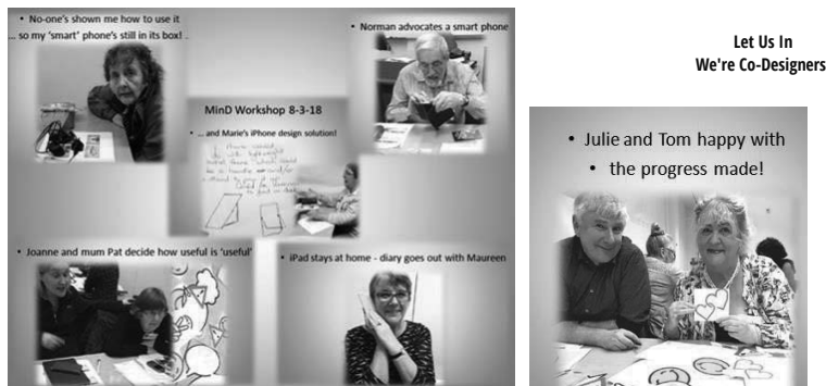
Figure 3: MinD co-design Workshop

The process and outcomes of this workshop assisted to direct MinD to the importance of multiple systemic relationships between assemblages of people with one another and with objects within their lived in networks. The understandings of this were encapsulated in and navigated all future thinking through AIR.