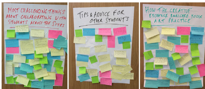
Figure 2 Billboards reflecting student feedback, Coventry University