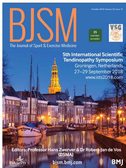
Figure 1 Cover from 2018.