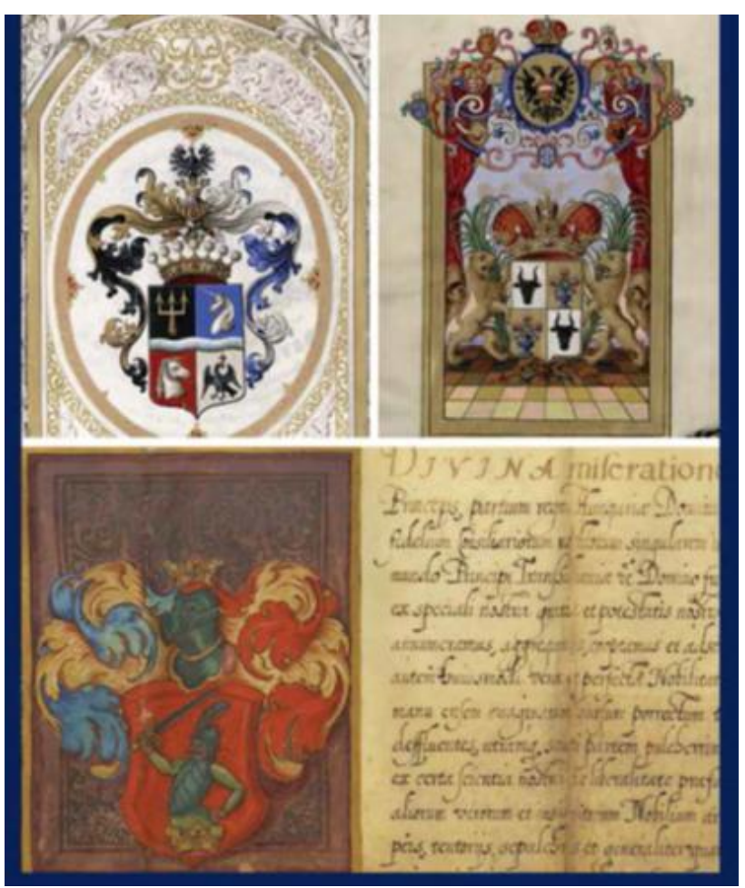
Fig. 4. Documents from Seals - History Treasure exhibition

Figure 4 presents historical documents that were included in the Seals - History Treasure exhibition catalogue. They are important cultural components of the exhibition and they can be physically found only at the Romanian Academy Library.