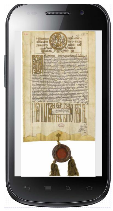
Fig. 3. Historical document from Seals - History Treasure exhibition

can be carefully studied in order to discover all the security elements used in that period of time to secure a document.