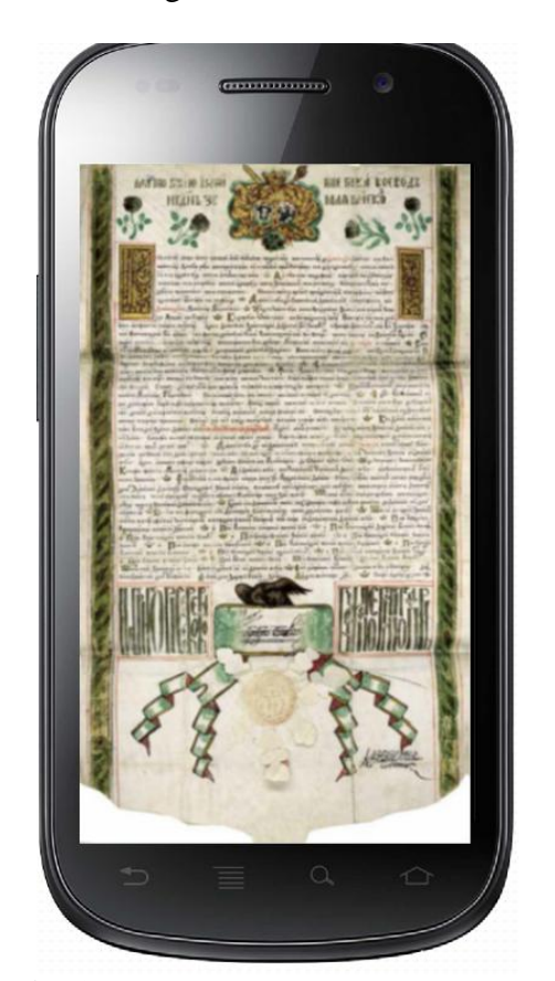
Fig. 2. Mobile view of Seals - History Treasure exhibition

attractive virtual exhibitions, such as presented in Figures 2 and 3.